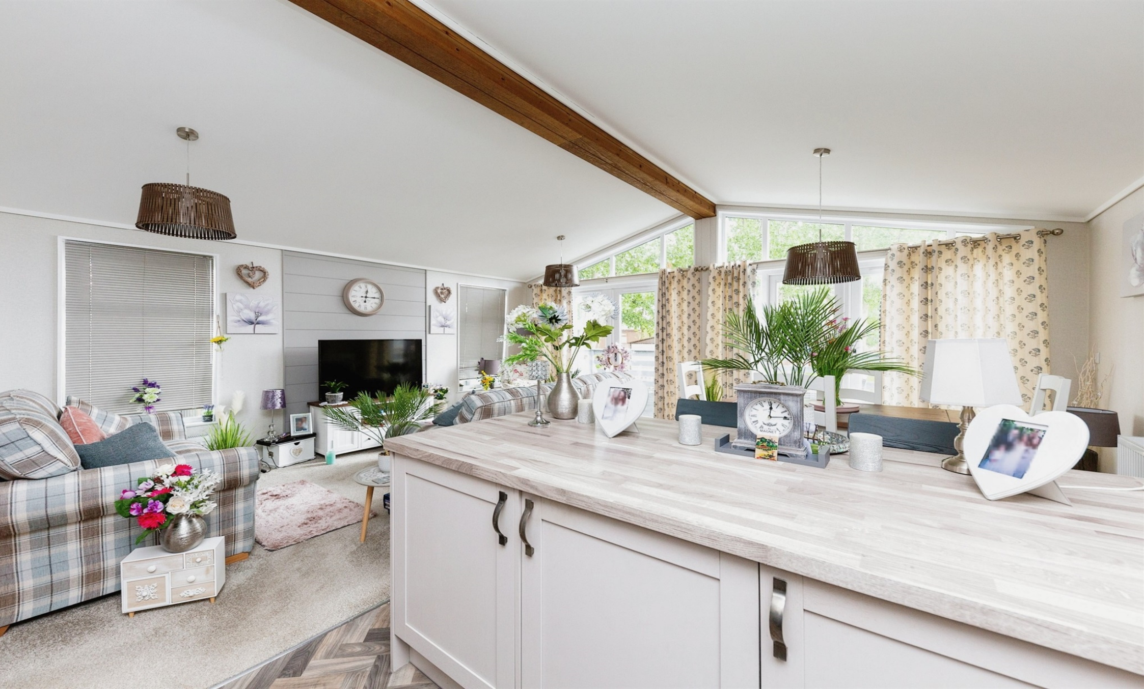
The Fairways, Much Hadham SG10 6JE