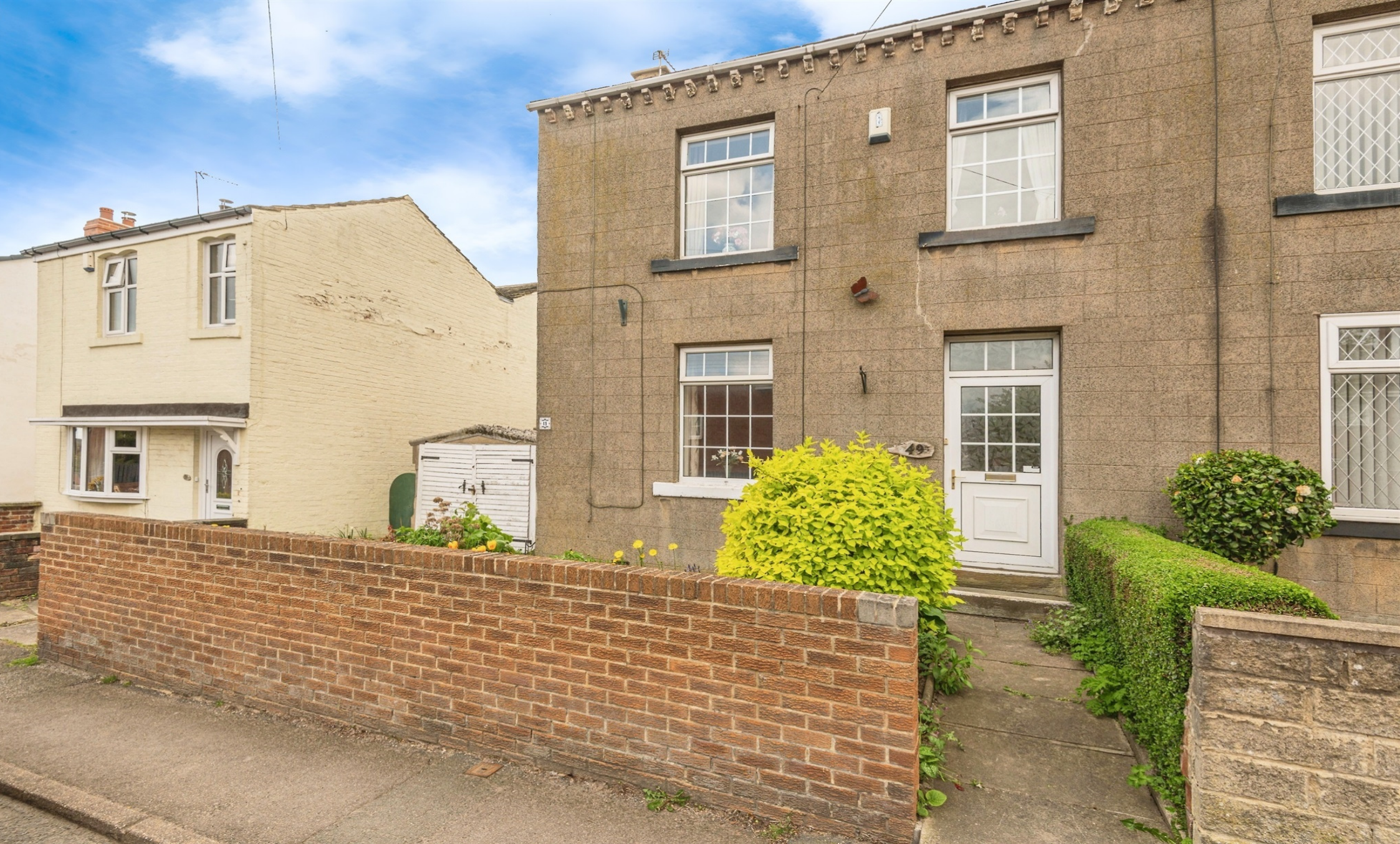
Horbury Road, Ossett WF5 0BS