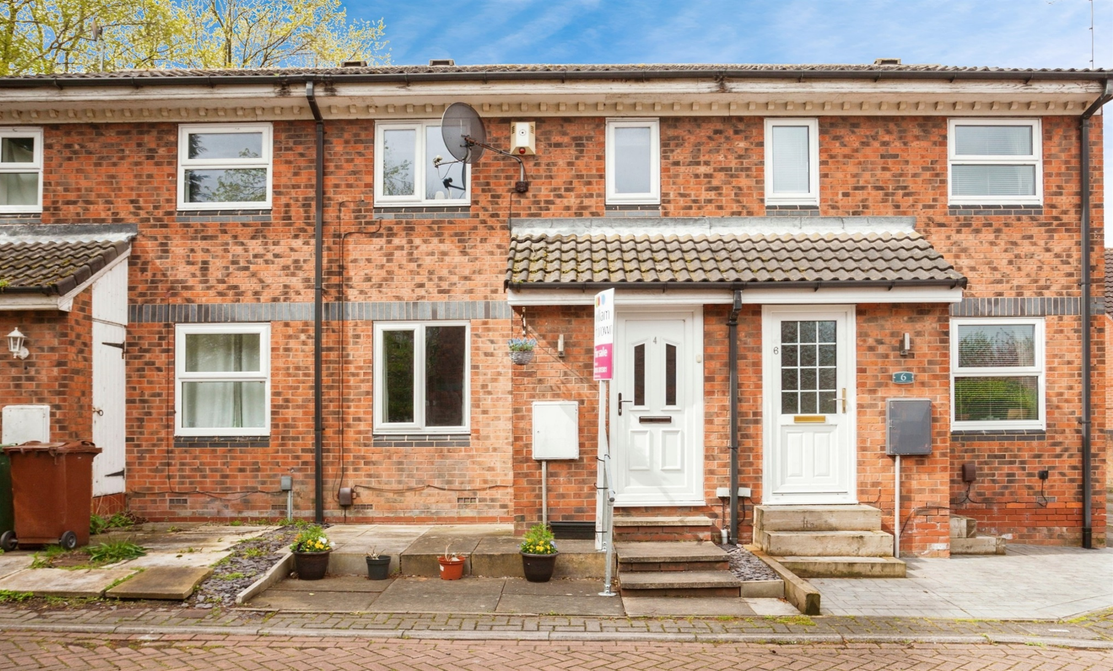
Woodbridge Close, Eastmoor Wakefield WF1 4LN