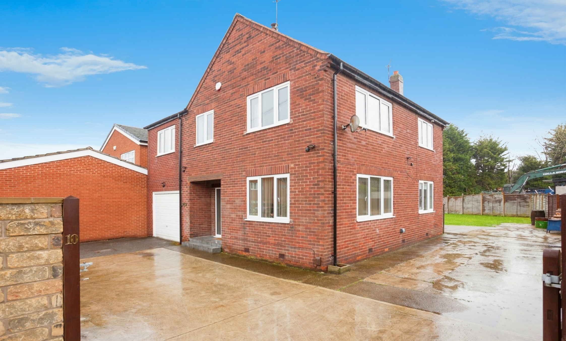
Back Mount Pleasant, Wakefield WF1 4NP