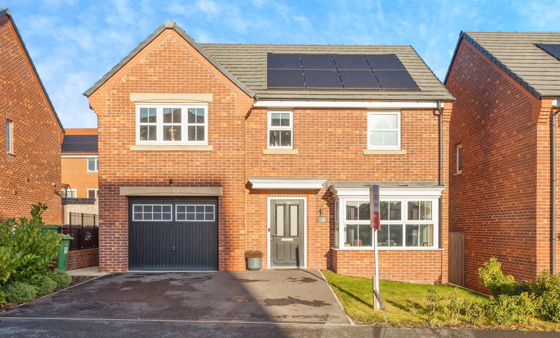
Stanley Parkway, Stanley WAKEFIELD WF3 4FR

Not for marketing purposes INTERNAL USE ONLY