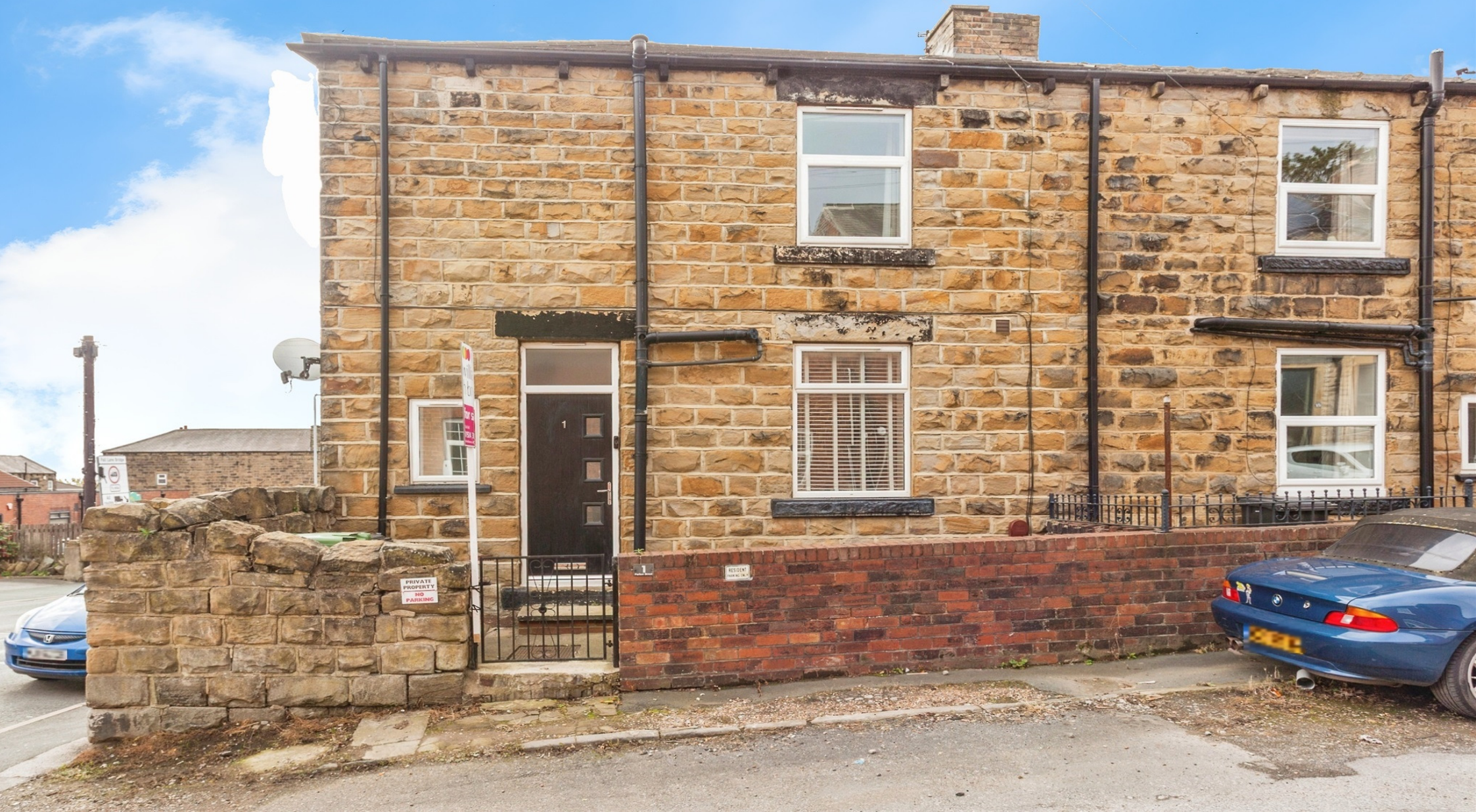
Parker Street, East Ardsley Wakefield WF3 2AF