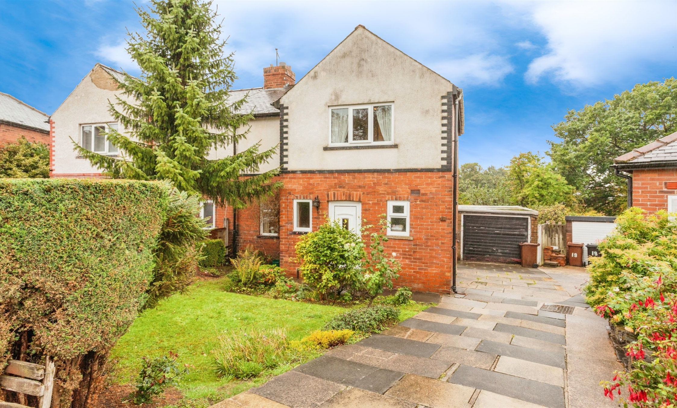
Sunny View, East Ardsley Wakefield WF3 2JP