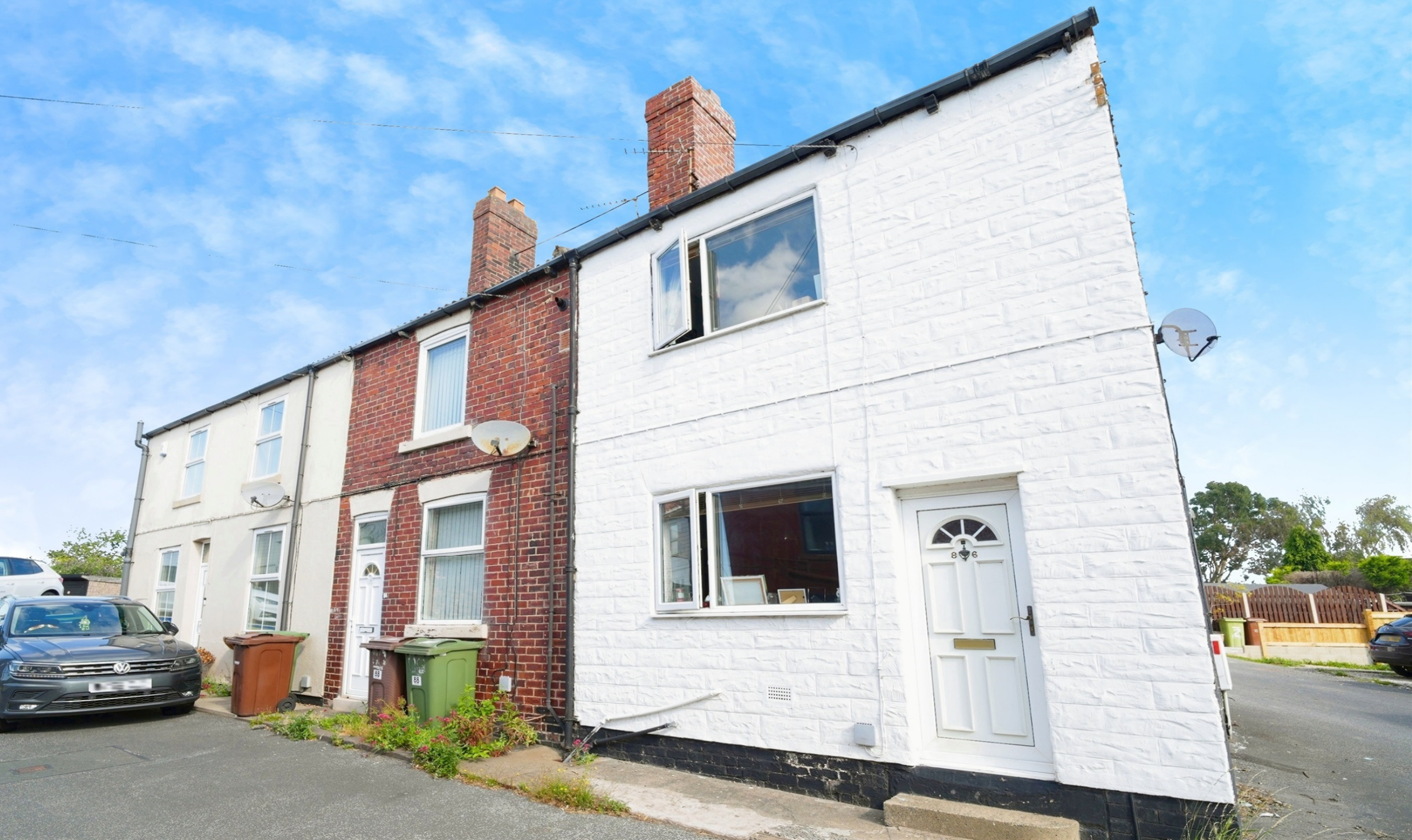
High Street, New Sharlston Wakefield WF4 1BE