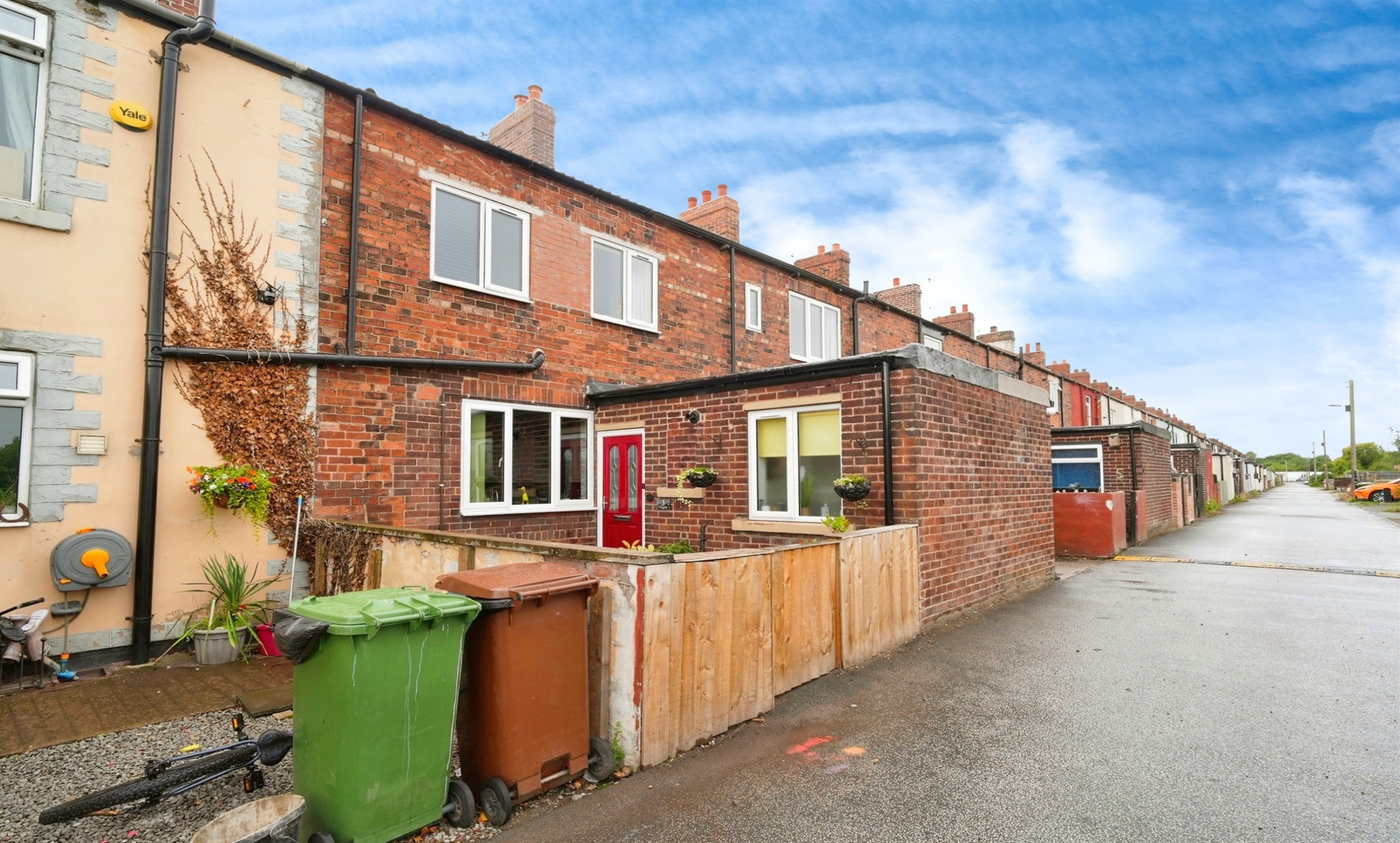
Long Row, New Sharlston Wakefield WF4 1BH