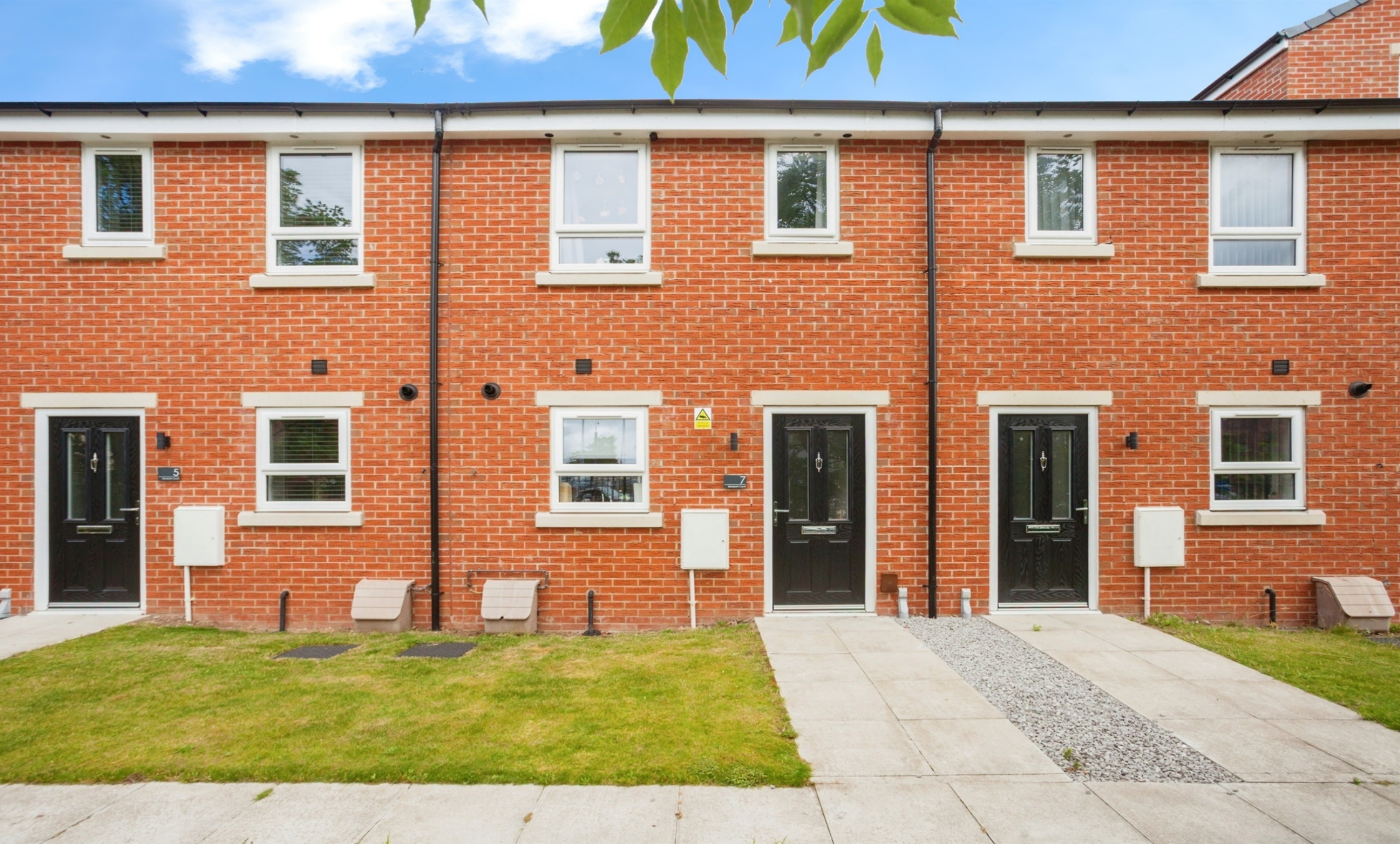
Elizabeth Court, Wakefield WF2 9NG