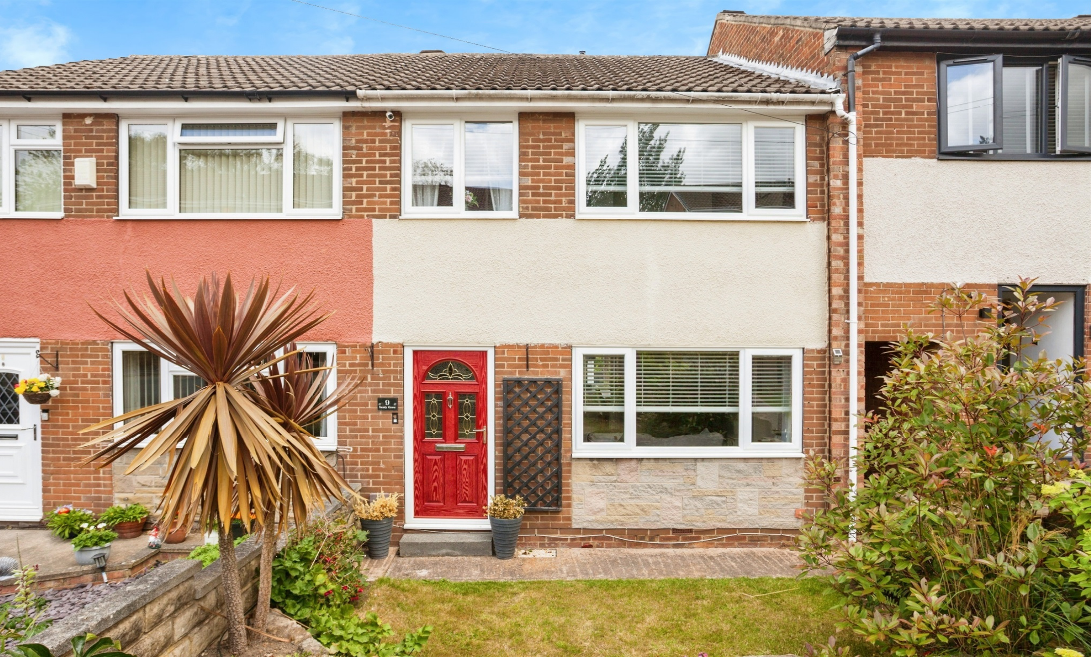
Sandy Grove, Rothwell LEEDS LS26 0TB