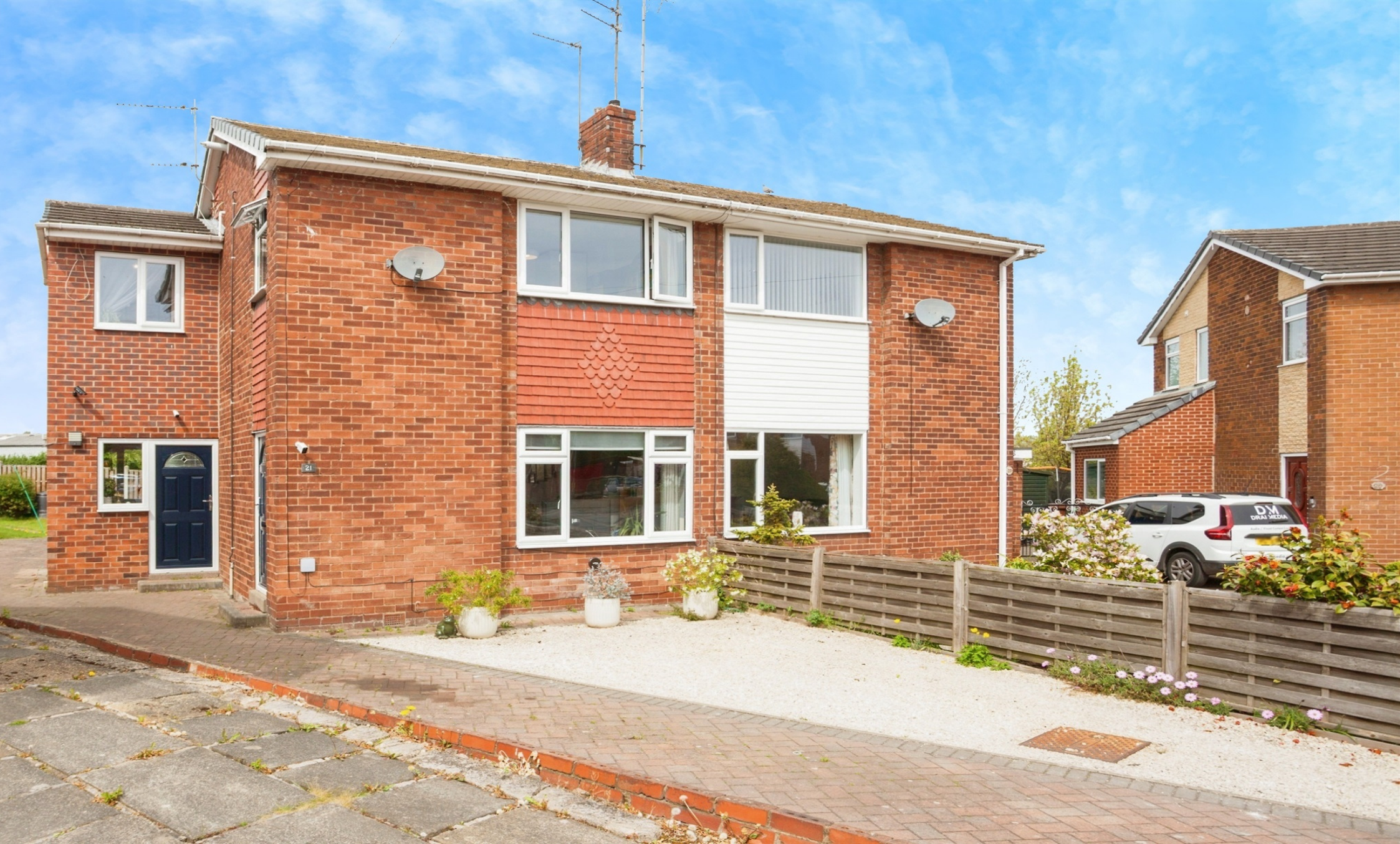
Hall Cliffe Grove, Horbury Wakefield WF4 6DE