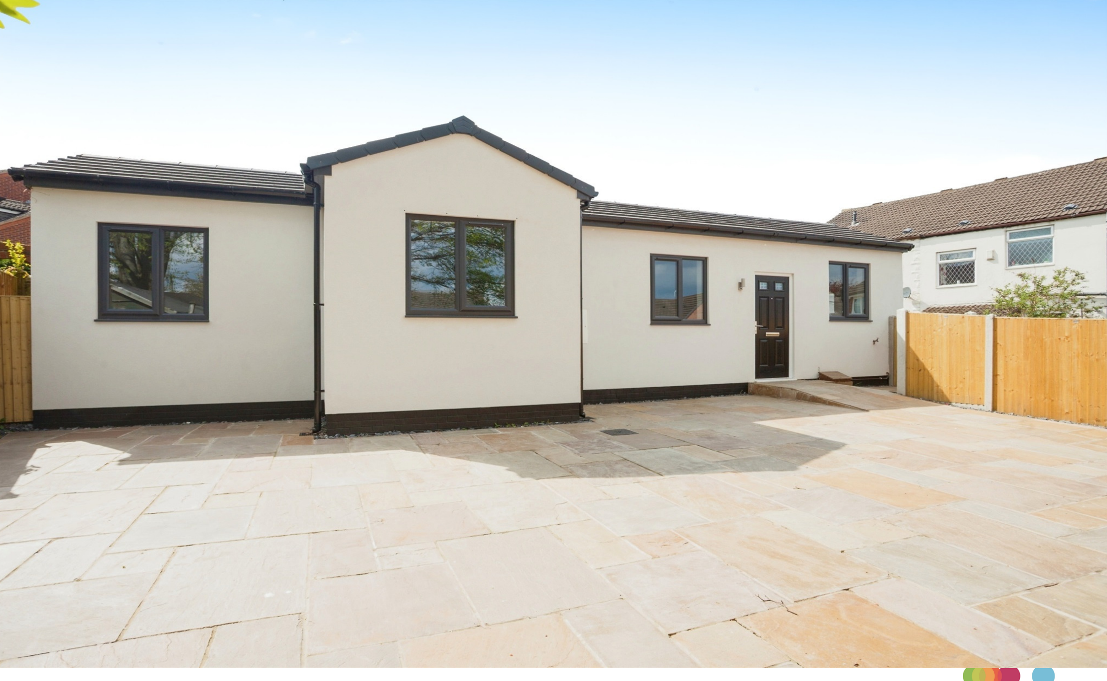
Garth Avenue, Normanton WF6 1DJ