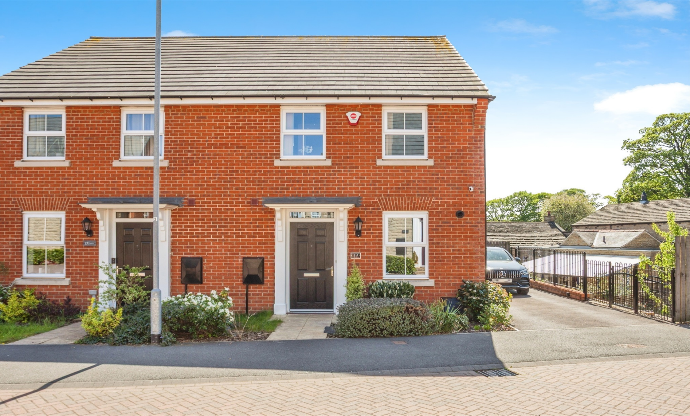
Grange Ash Close, Flockton Wakefield WF4 4FF