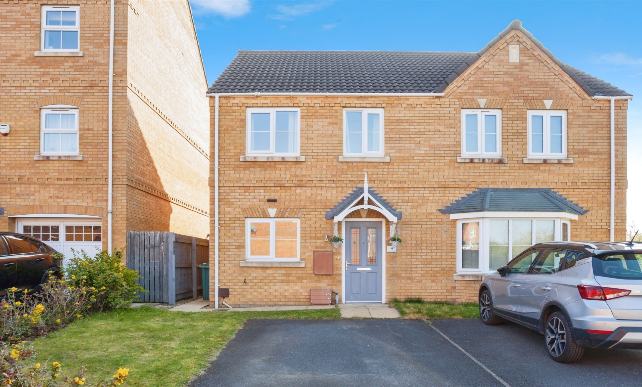
Springfield Crescent, Lofthouse WAKEFIELD WF3 3FQ

Not for marketing purposes INTERNAL USE ONLY