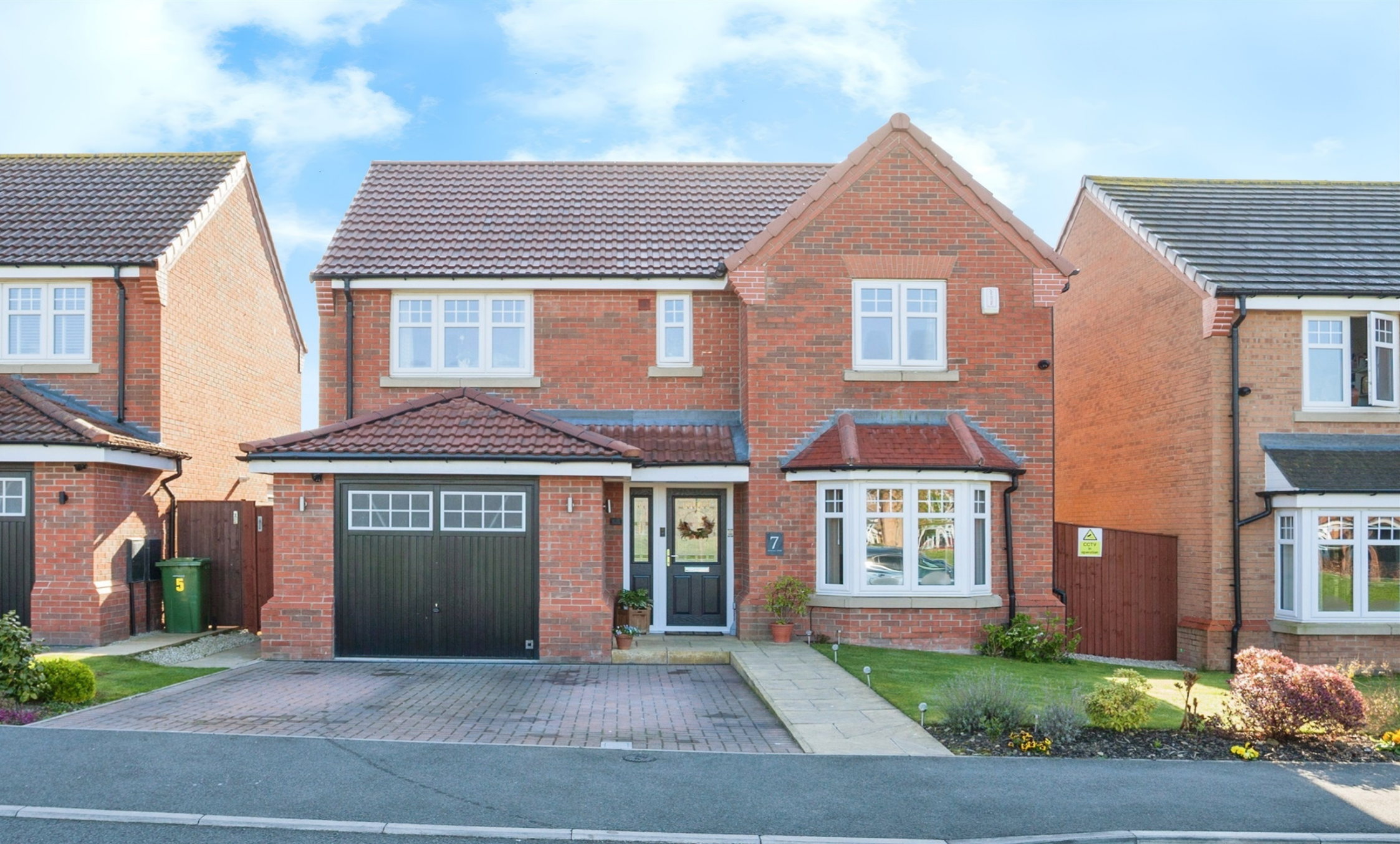
Herbage View, Crofton Wakefield WF4 1FD