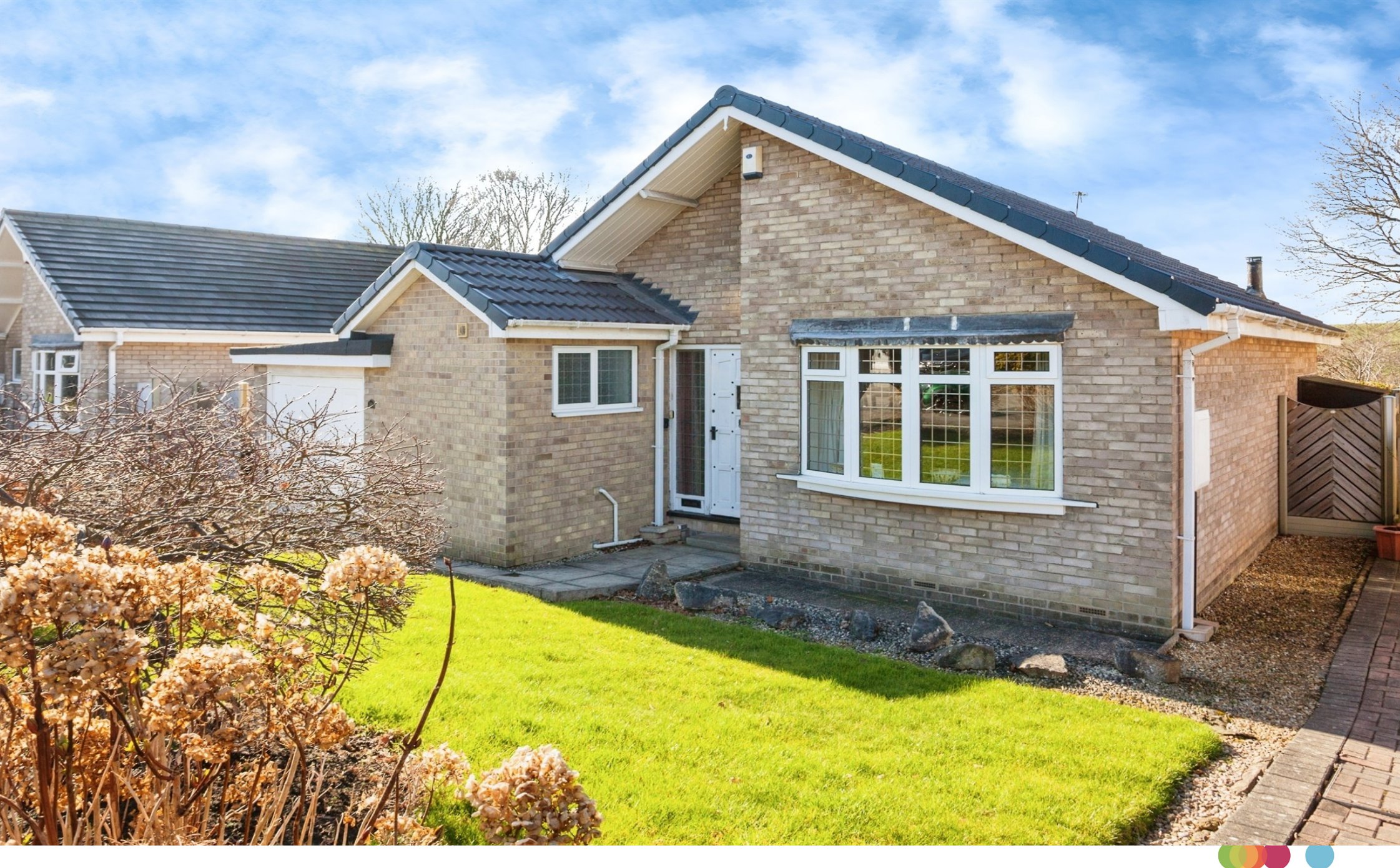
Woodfield Park, Walton Wakefield WF2 6PL