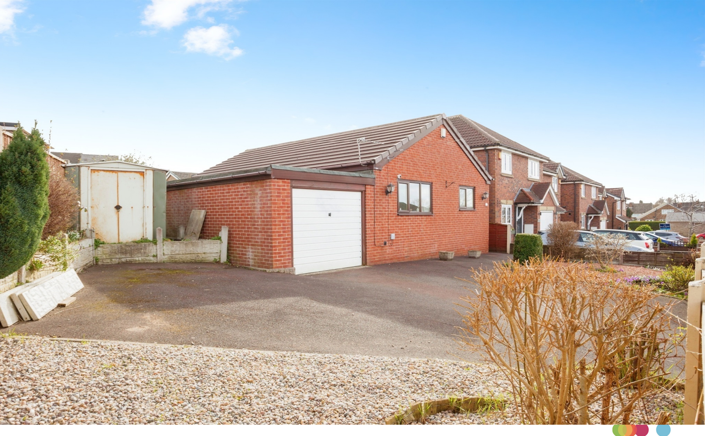
Danella Crescent, Wrenthorpe WAKEFIELD WF2 0TG