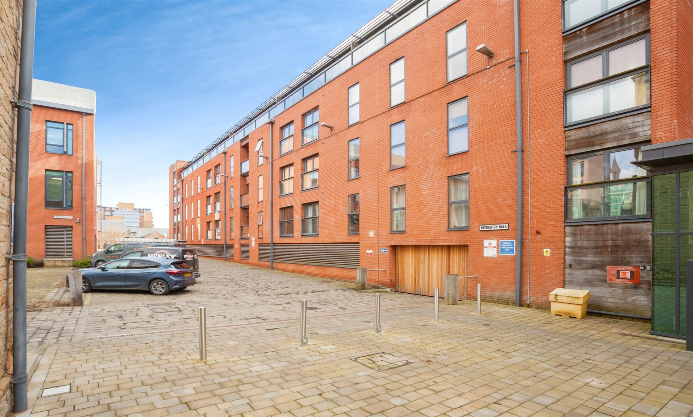
Hebble Wharf Navigation Walk, Wakefield WF1 5RD