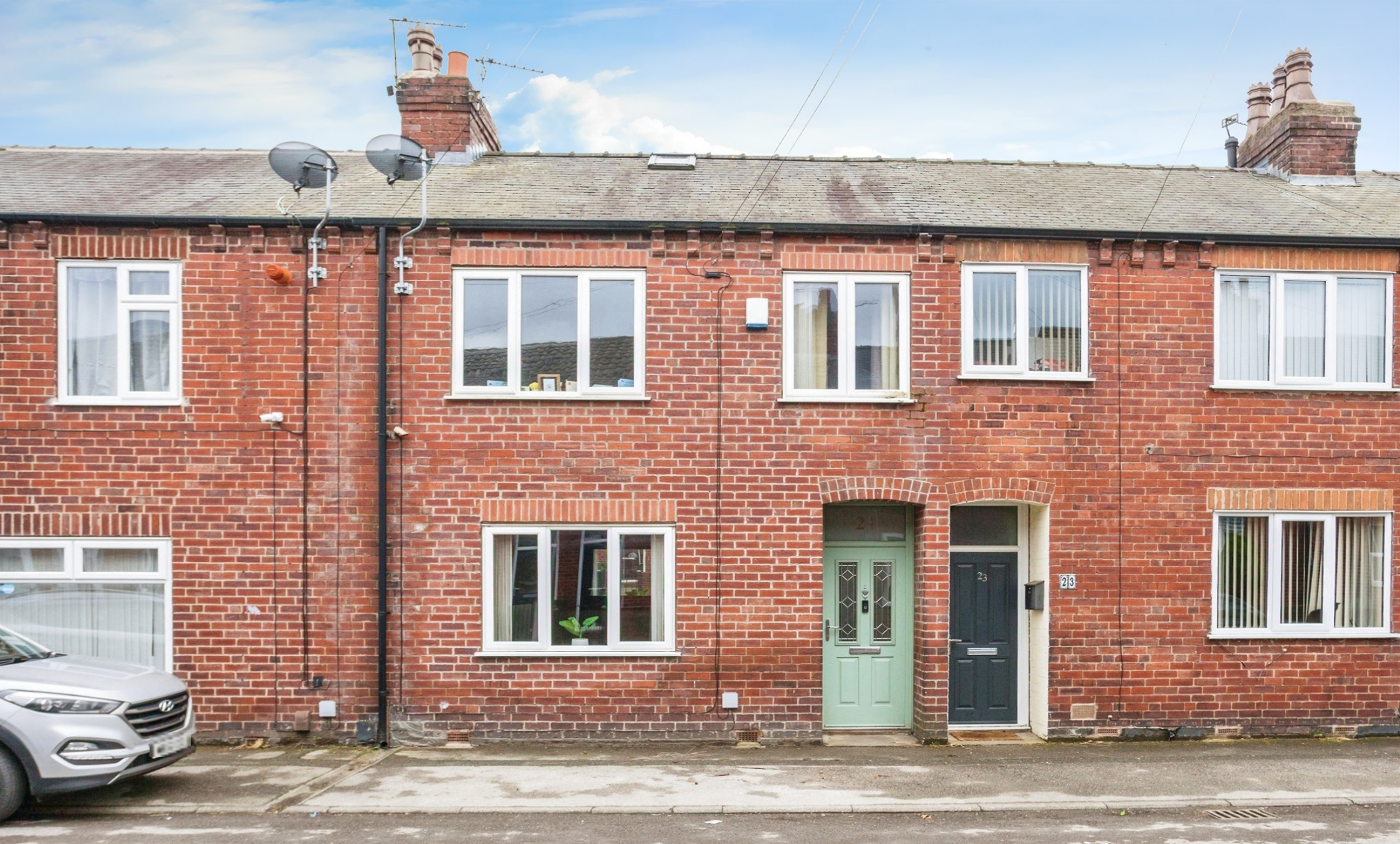
Ellins Terrace, Normanton WF6 1BL