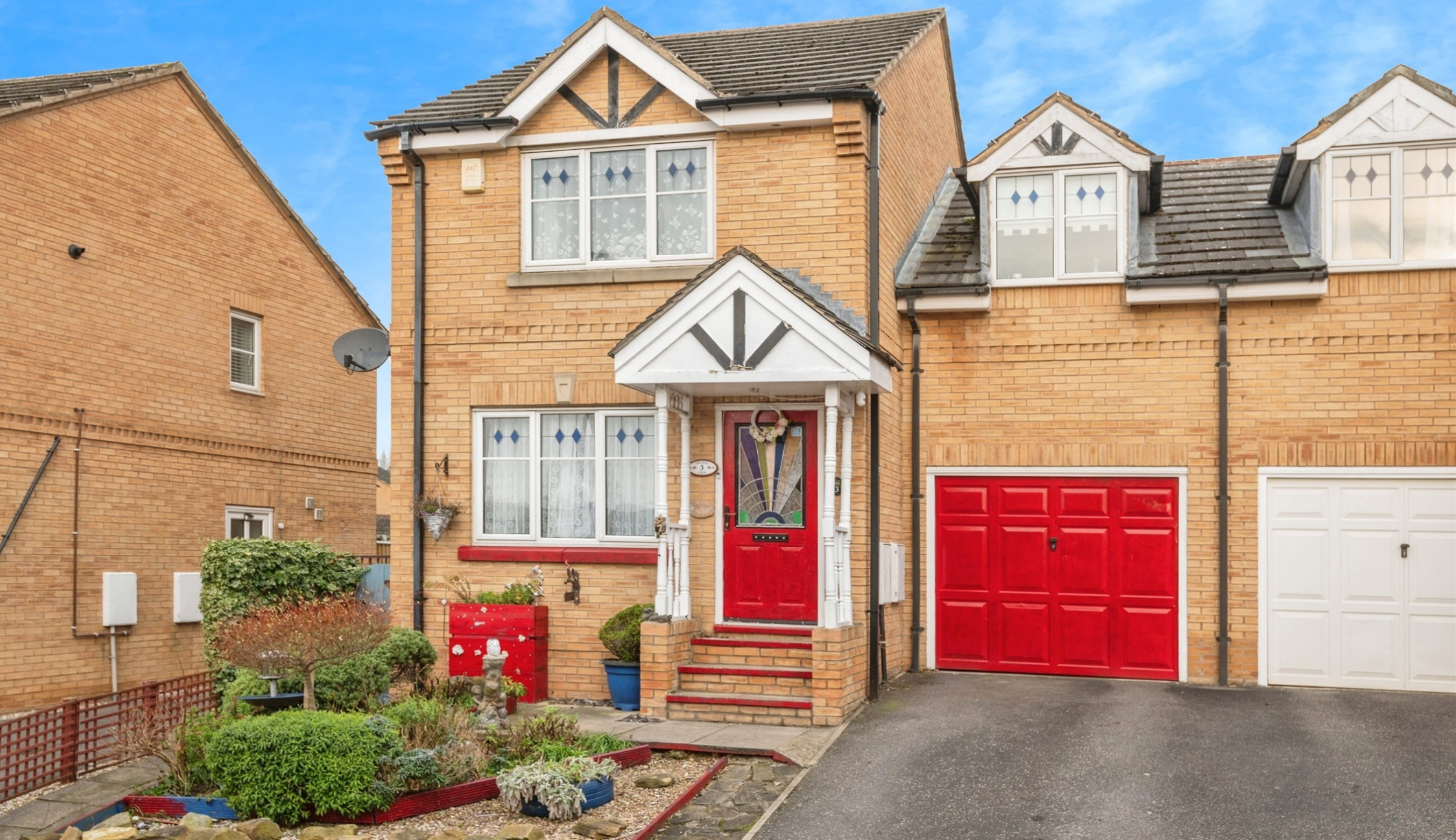
Orchid View, WAKEFIELD WF2 0FG