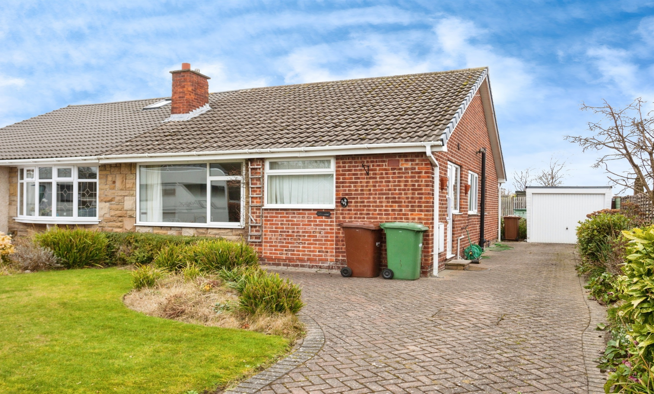
Coxley View, Netherton Wakefield WF4 4NE