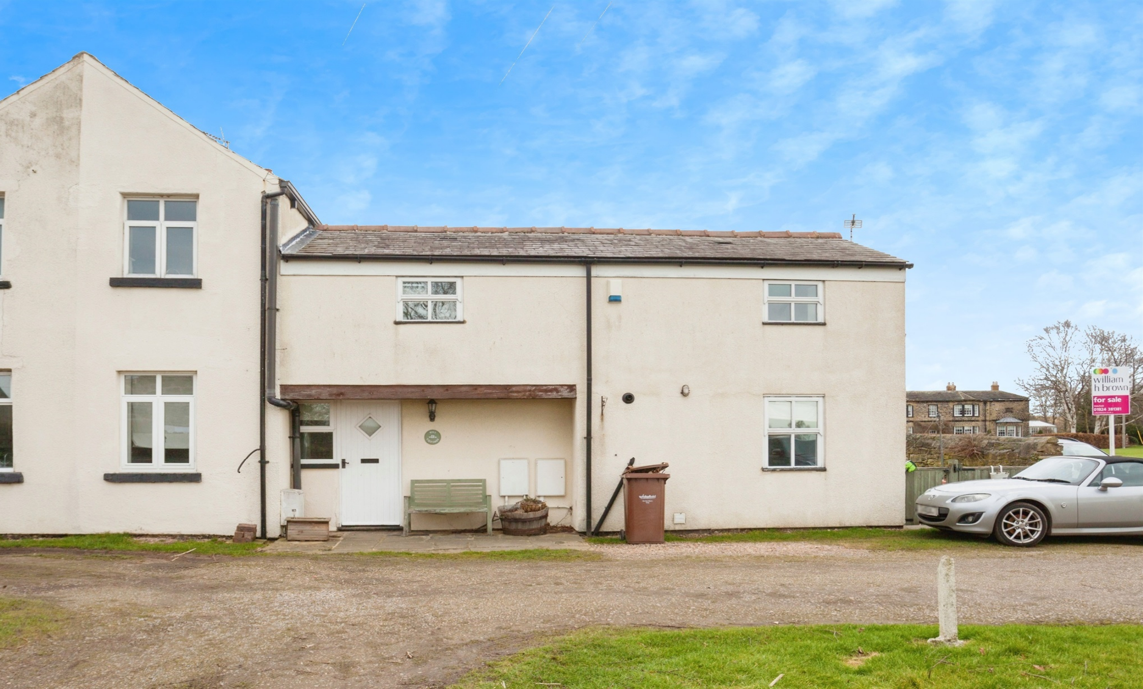
Hill Cottage Hill Cottage, Heath Wakefield WF1 5SN