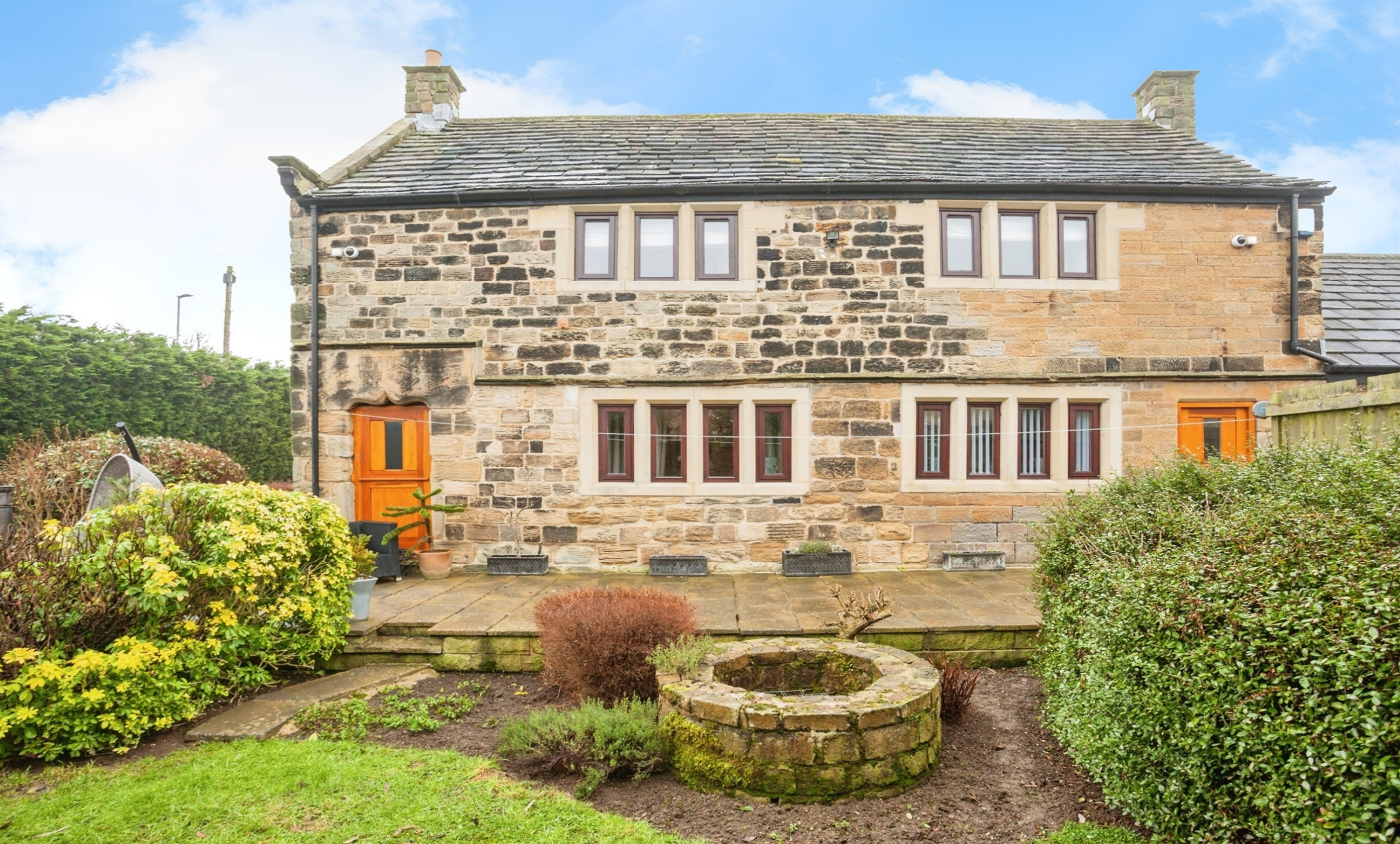
Bedford Farm Court, Crofton Wakefield WF4 1AN