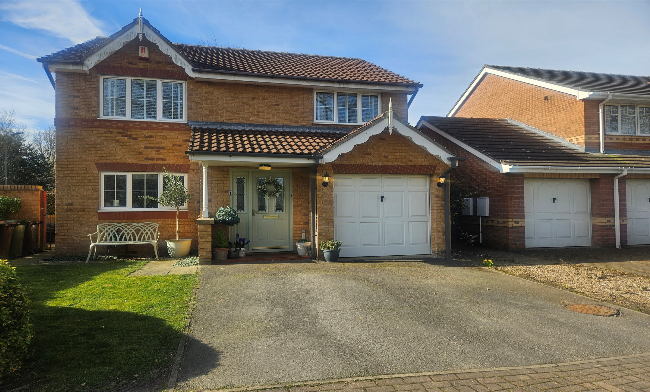
Hatfield View, Wakefield WF1 3SN