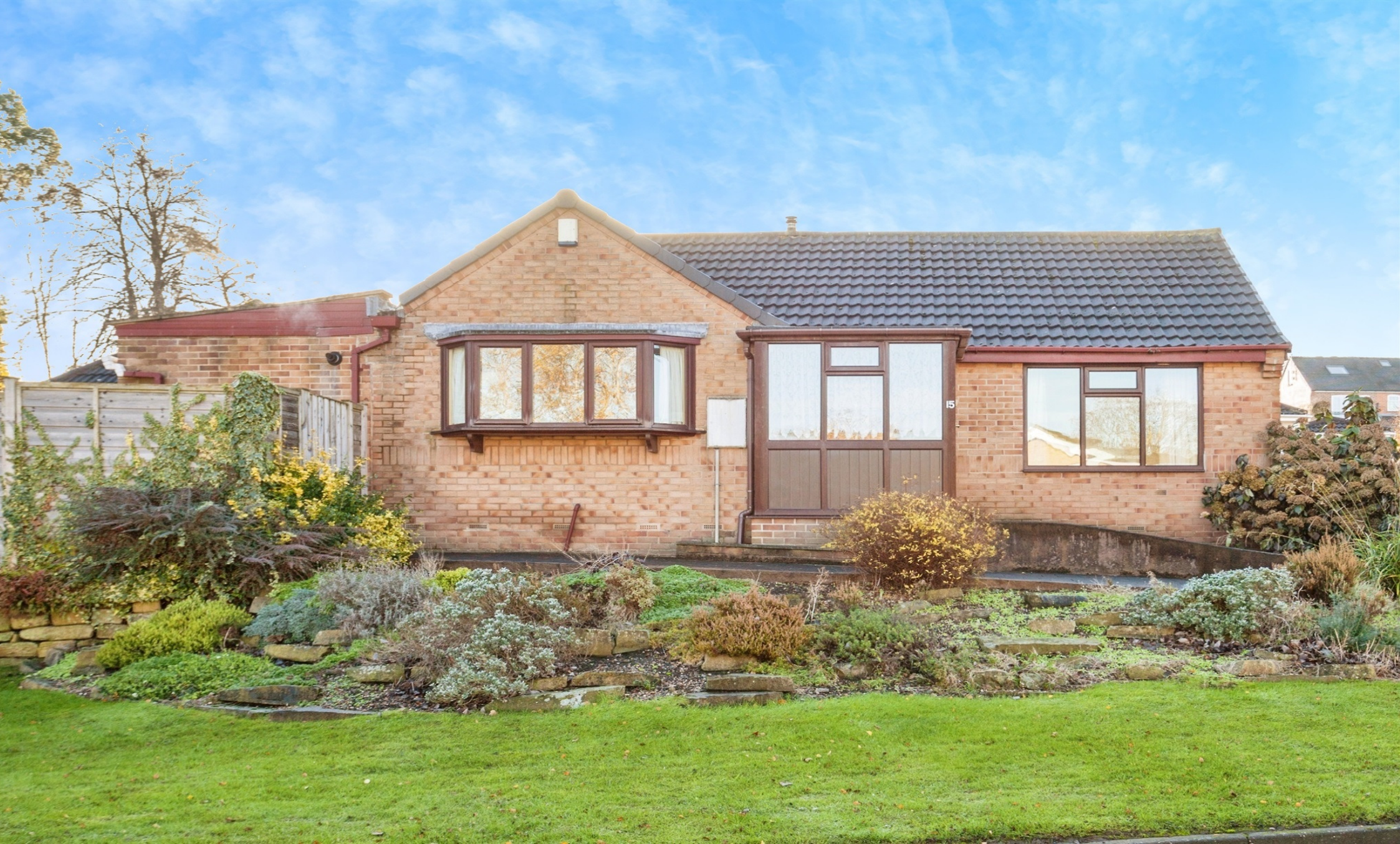
Springfield Grange, Wakefield WF2 9QA