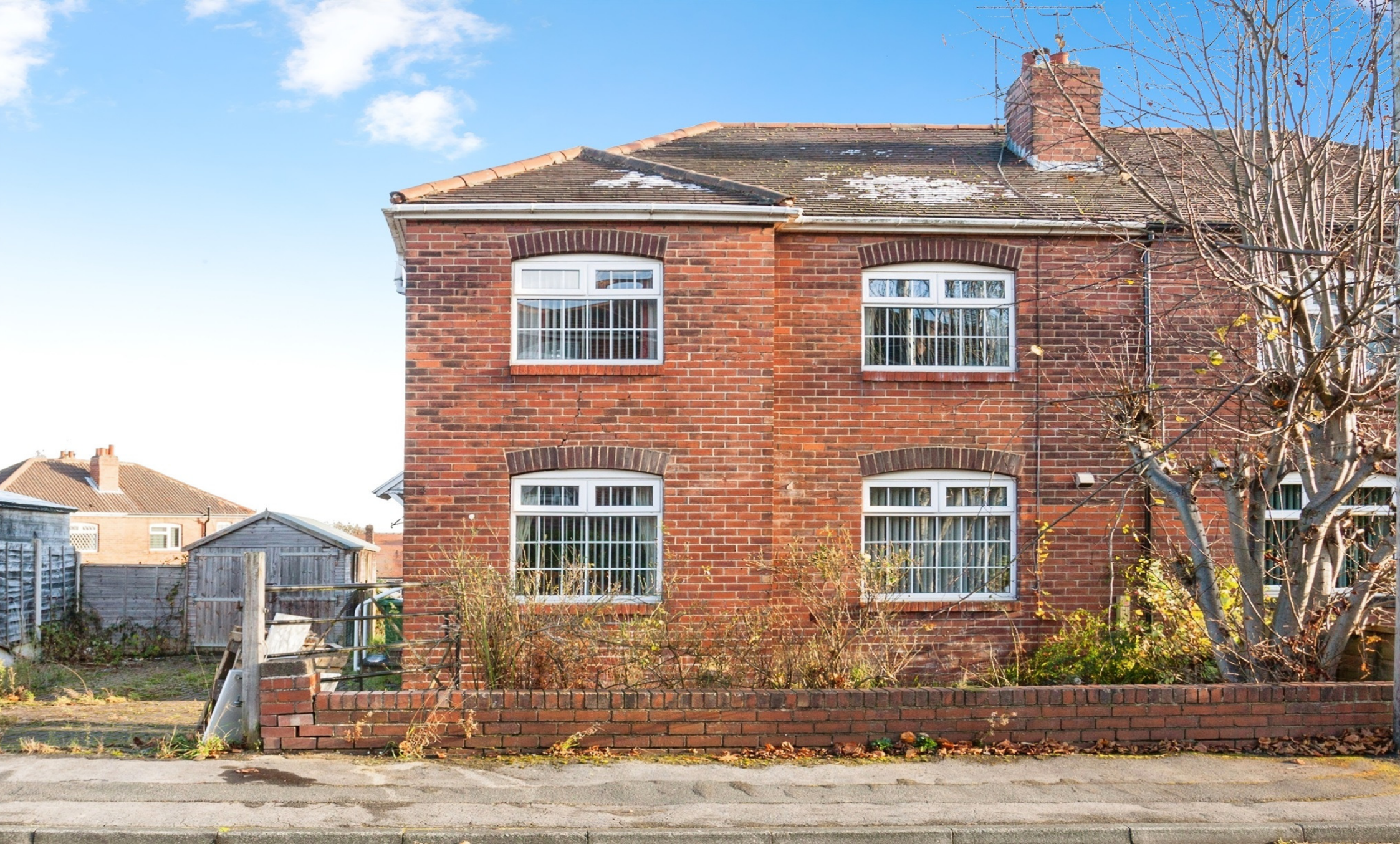
Scarth Terrace, Stanley Wakefield WF3 4BJ