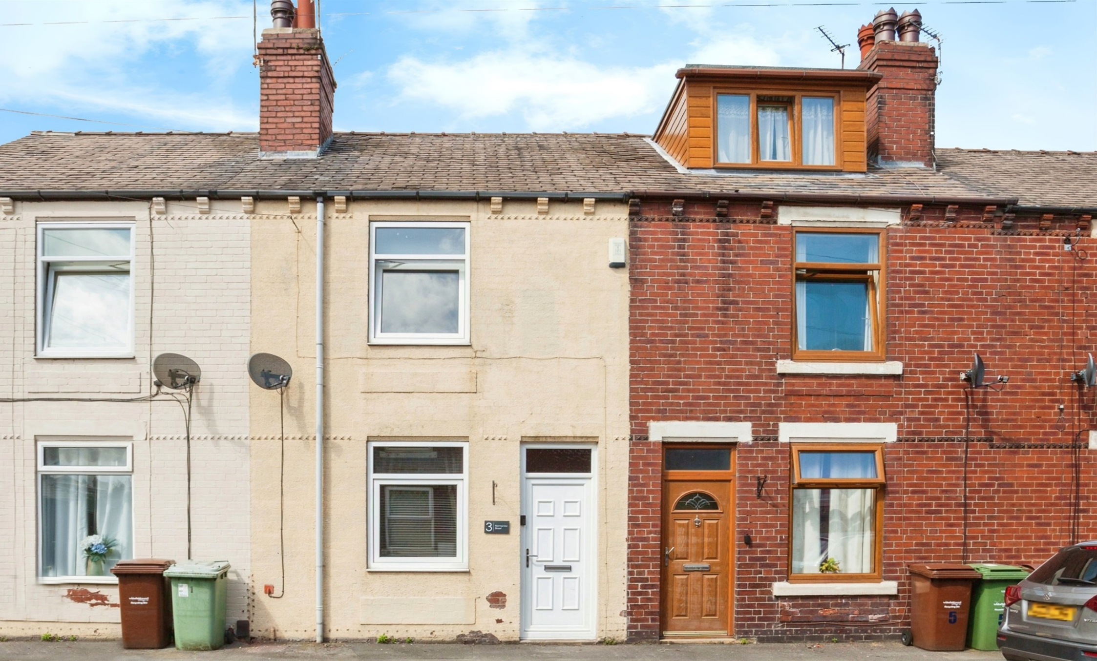
Normanton Street, Horbury Wakefield WF4 5EL