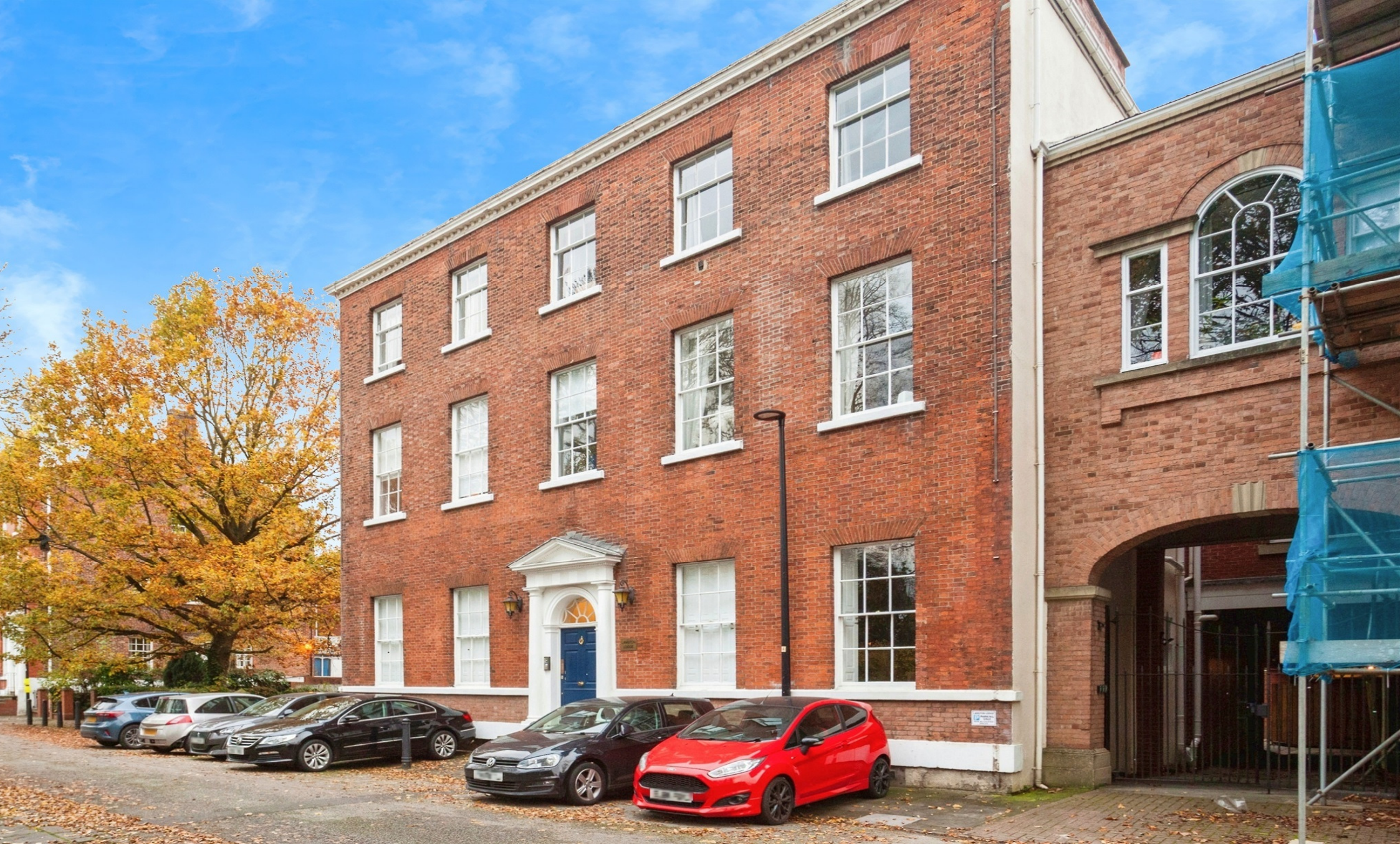
Langton Lodge South Parade, WAKEFIELD WF1 1LR