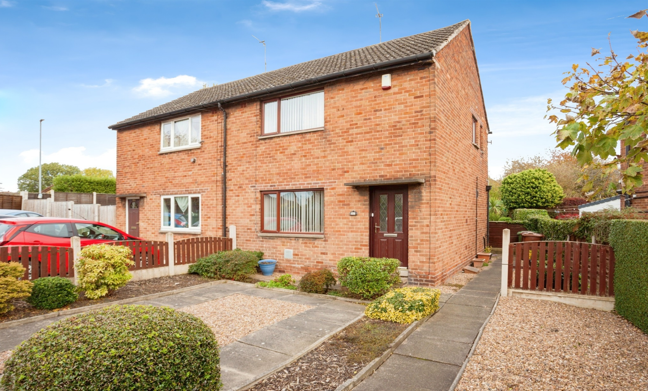
Parkhill Crescent, Wakefield WF1 4HD