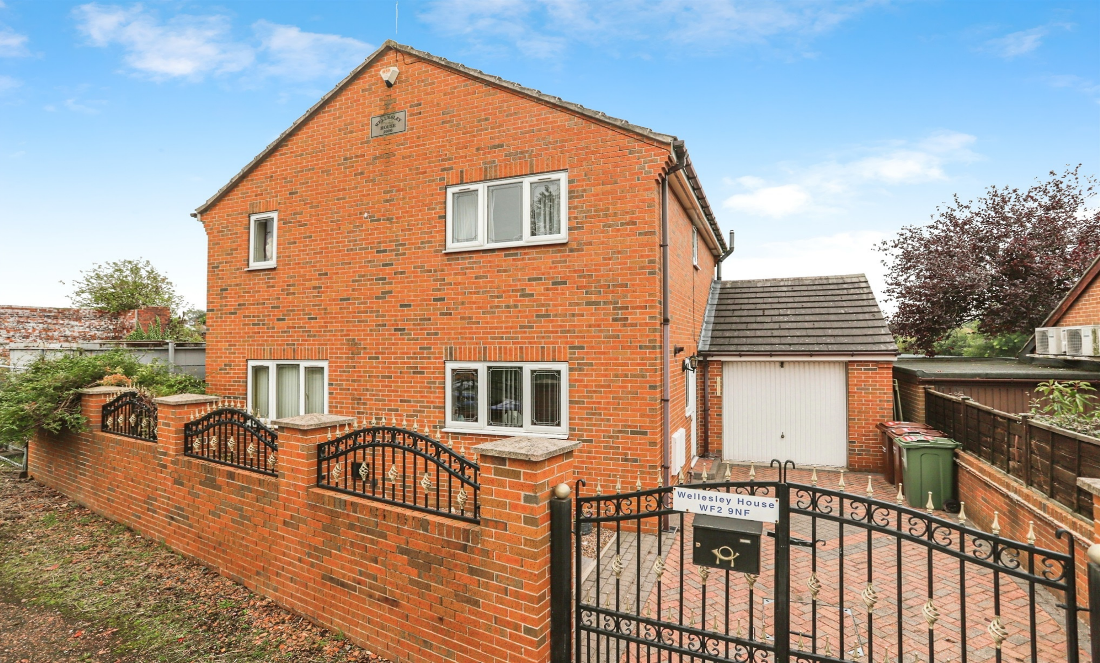
Wellesley Green, Wakefield WF2 9NF