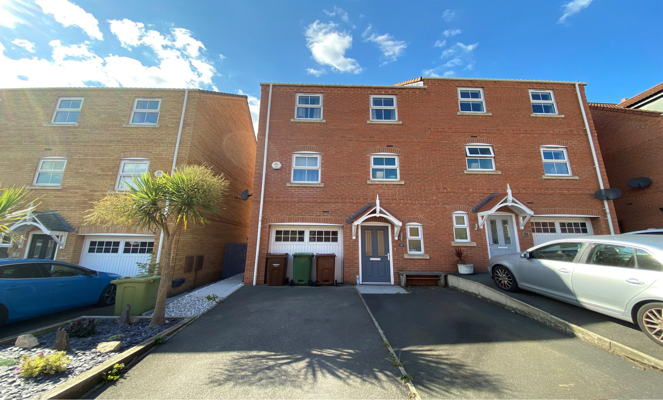
Springfield Rise, Lofthouse Wakefield WF3 3FP