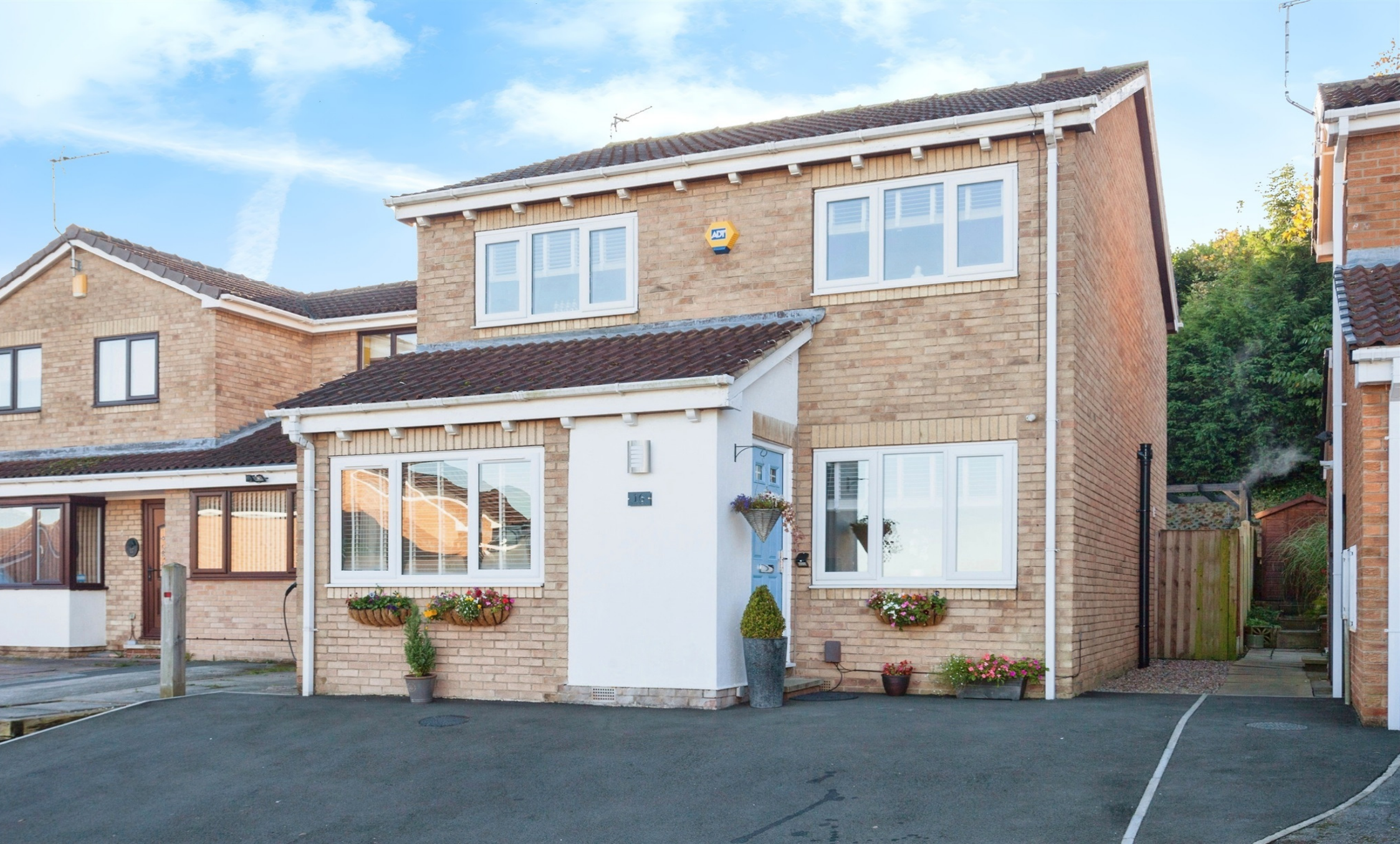
Durkar Rise, Crigglestone Wakefield WF4 3QB