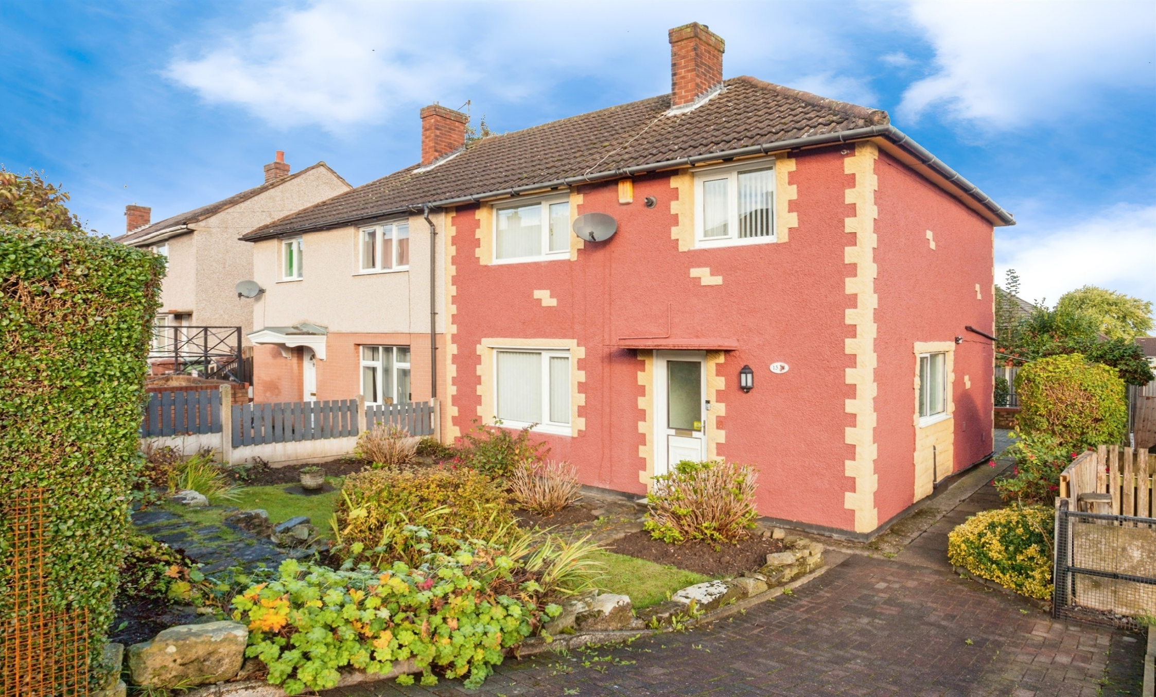
Hillcrest, Havercroft Wakefield WF4 2EW