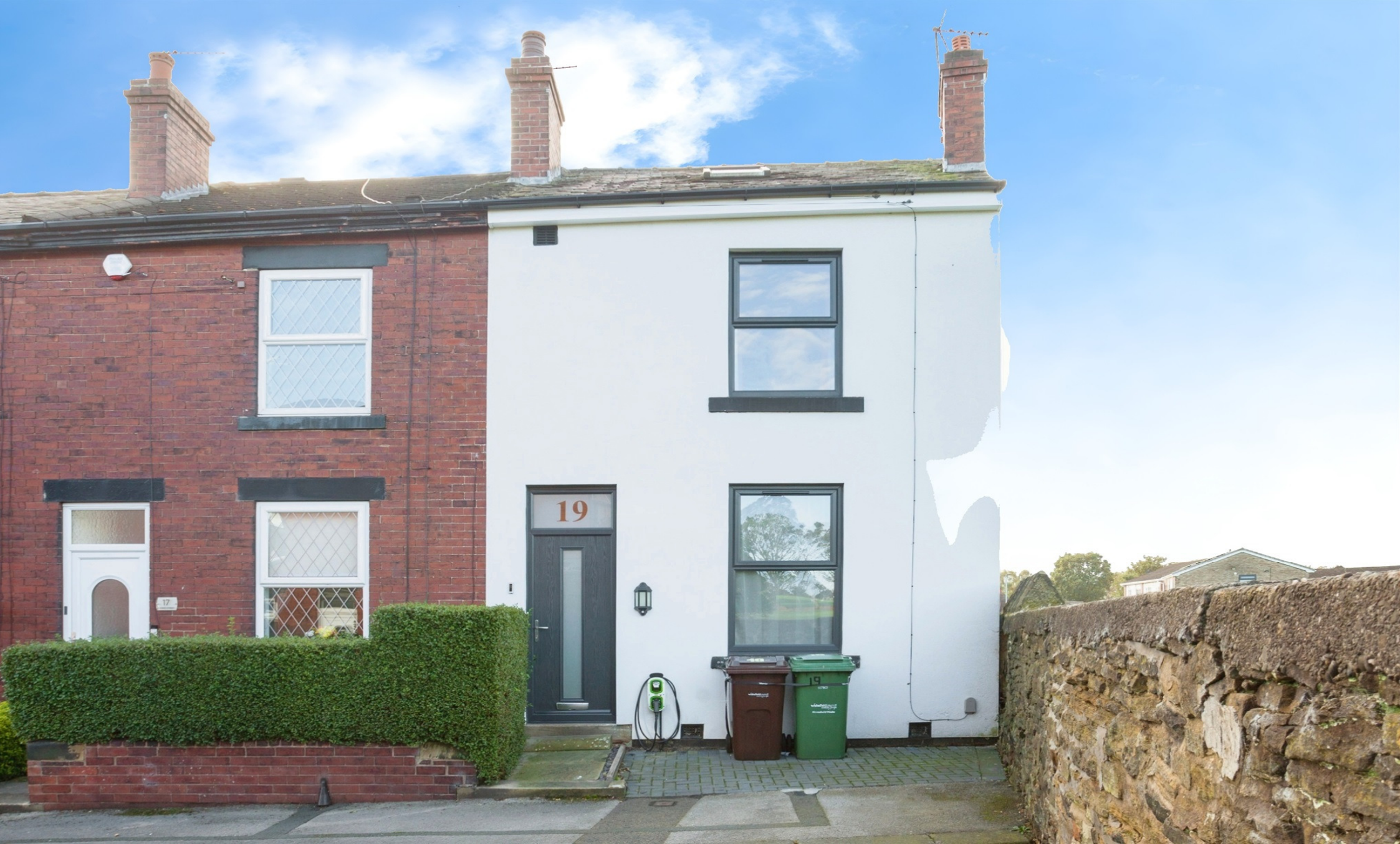
Audrey Street, Ossett WF5 0JN