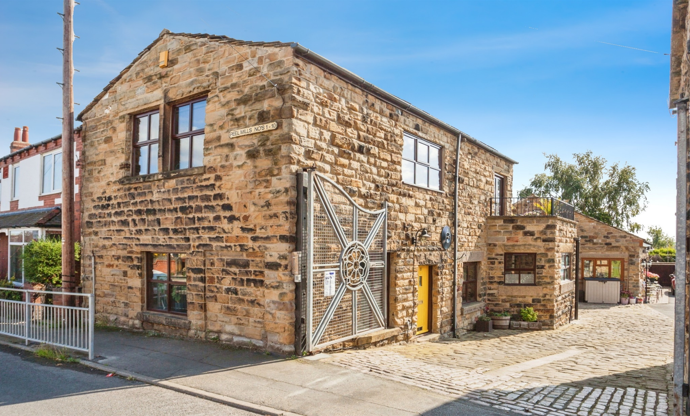
Peel Mills Peel Street, Horbury WAKEFIELD WF4 5AU