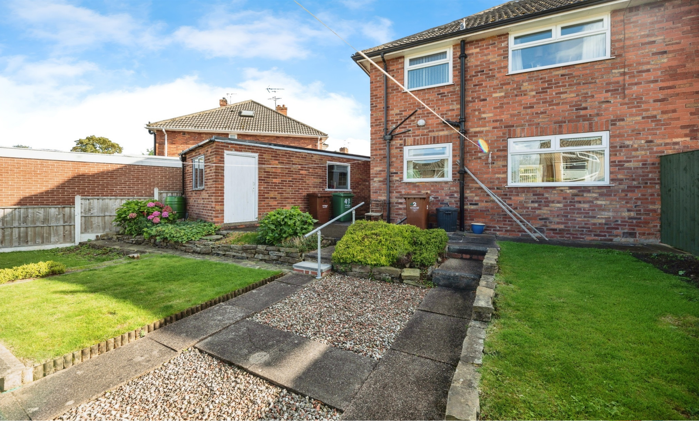
Ashleigh Avenue, WAKEFIELD WF2 9DA