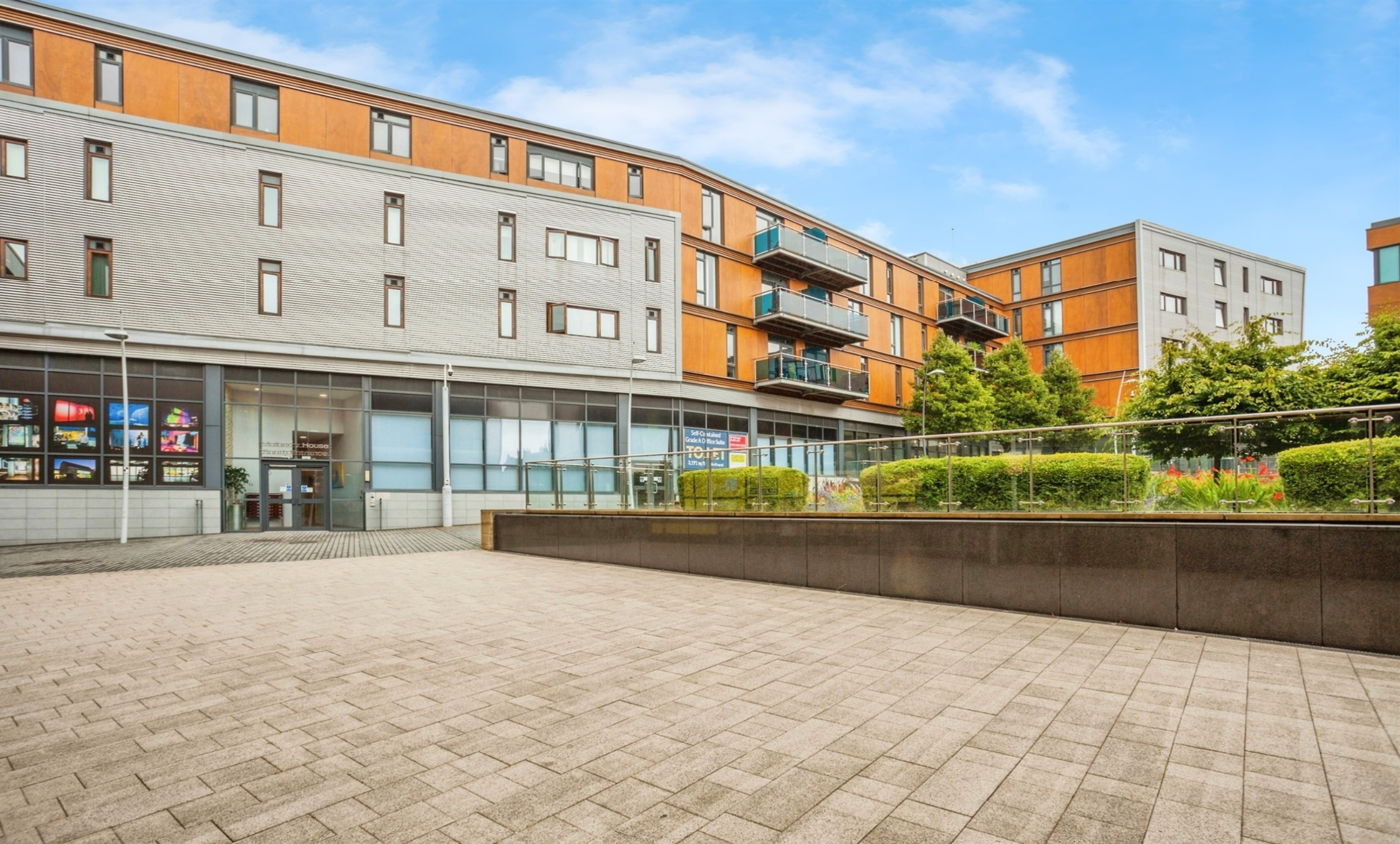
Mulbery House Burgage Square, Wakefield WF1 2SE