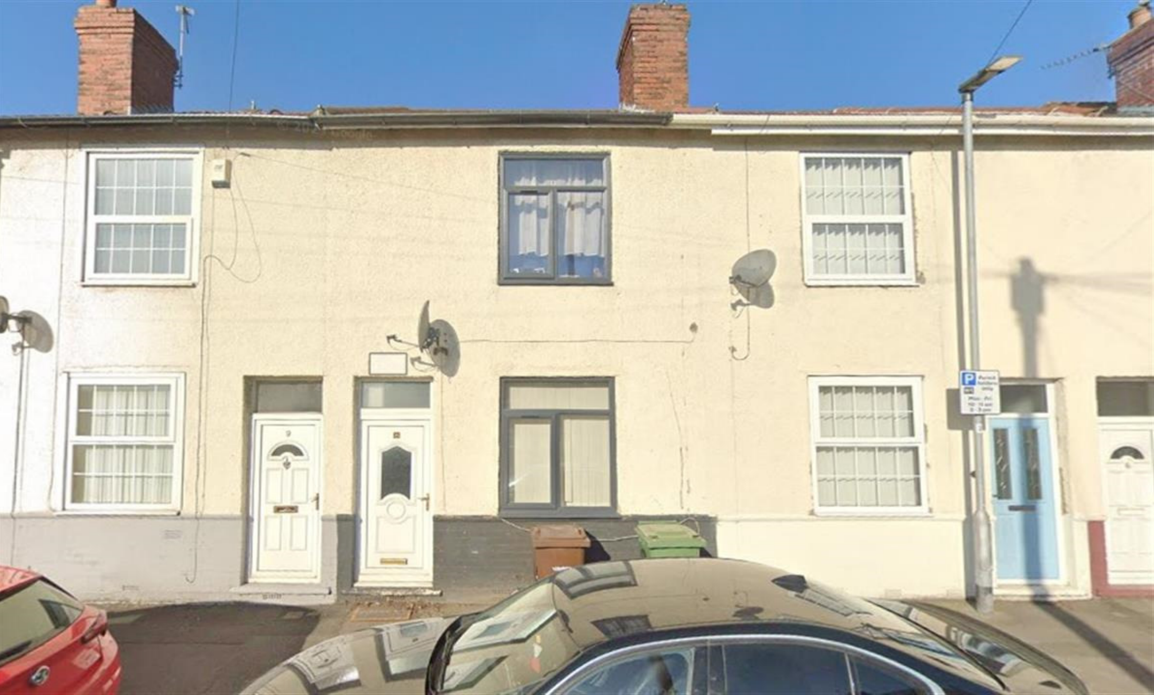
Balne Avenue, Wakefield WF2 9AT