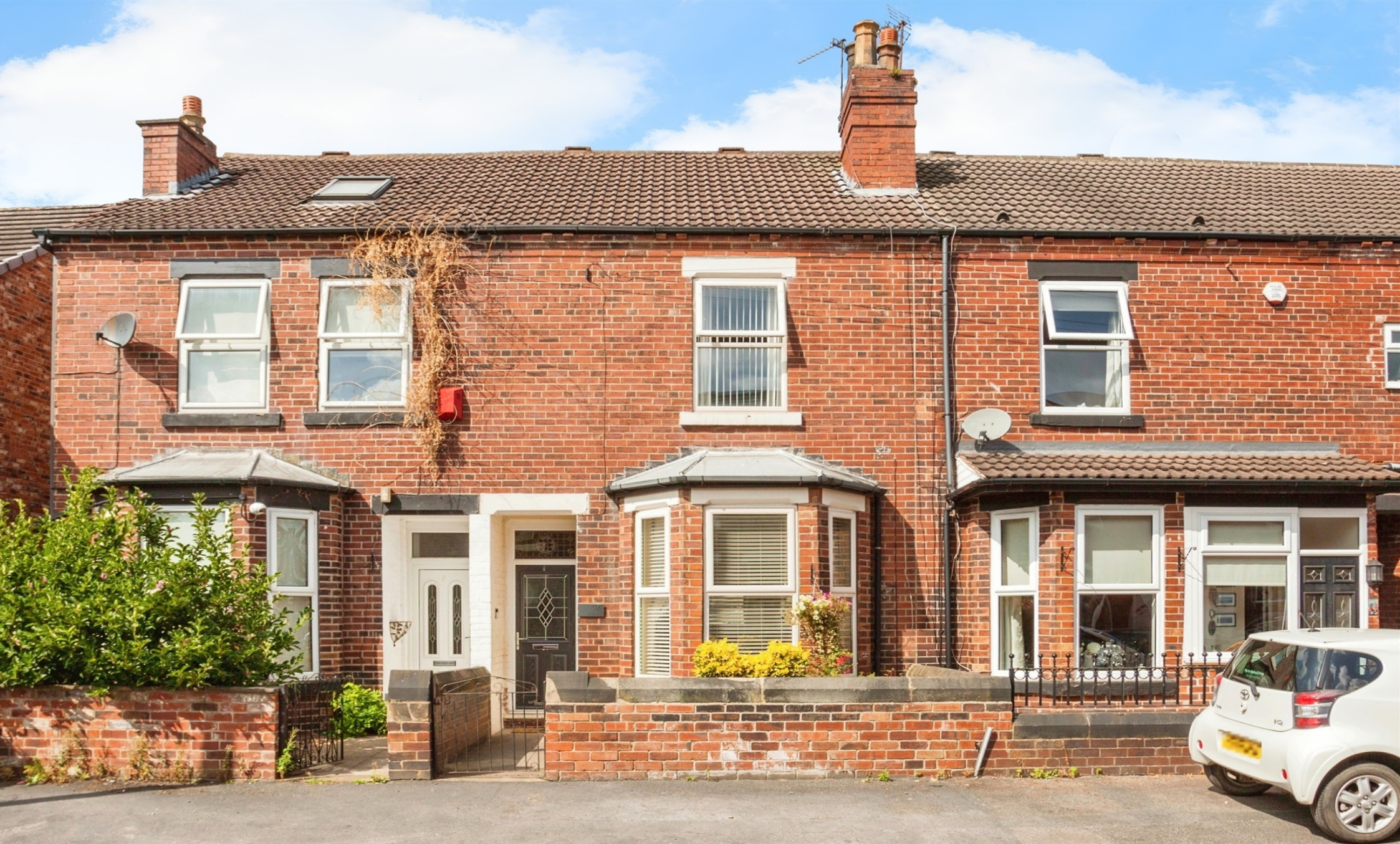
Burkill Street, WAKEFIELD WF1 5PA