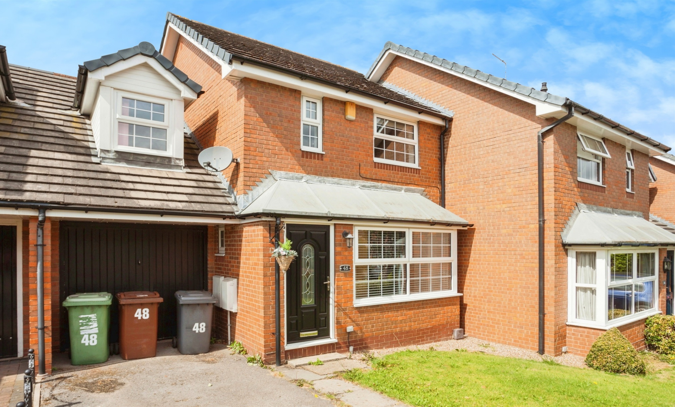
Meadowgate Croft, Lofthouse Wakefield WF3 3SS