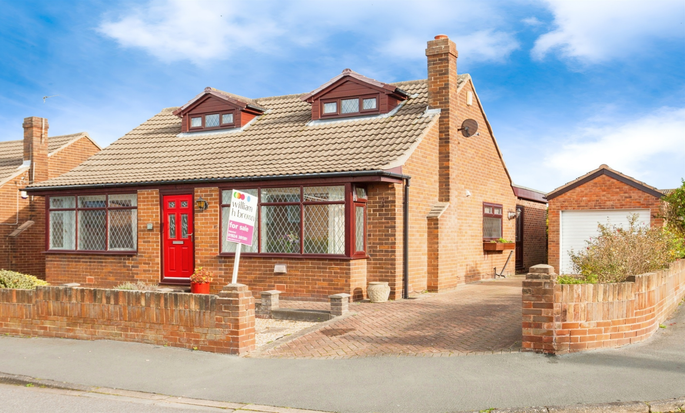
Birchen Avenue, Ossett WF5 8HT