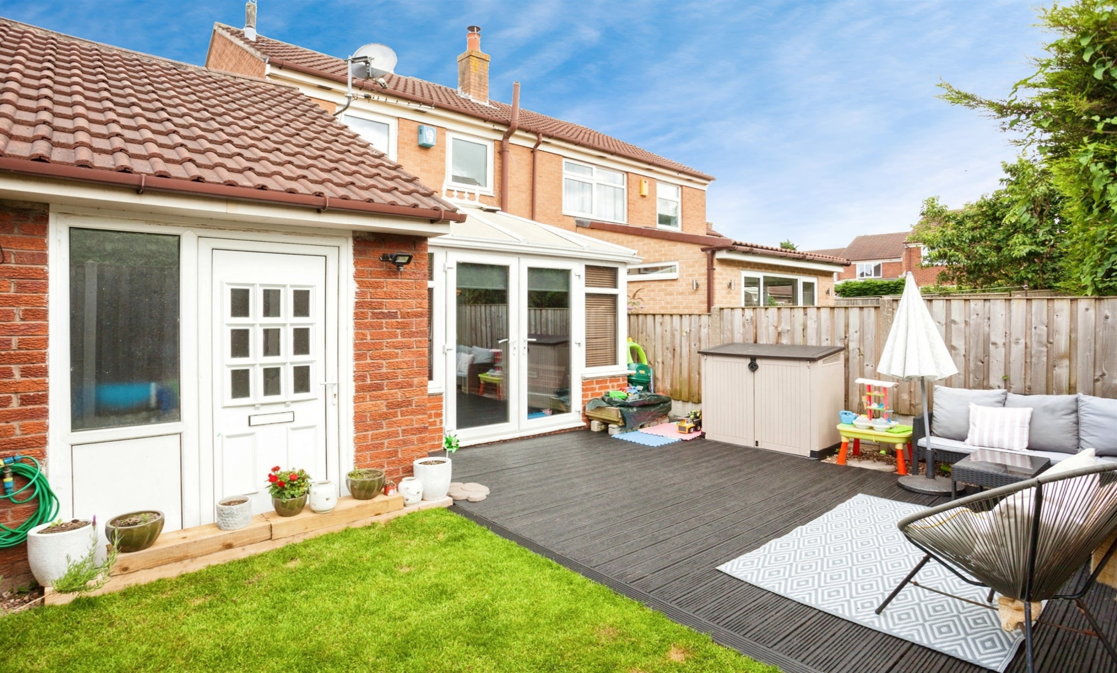
Rosewood Court, Rothwell Leeds LS26 0XG