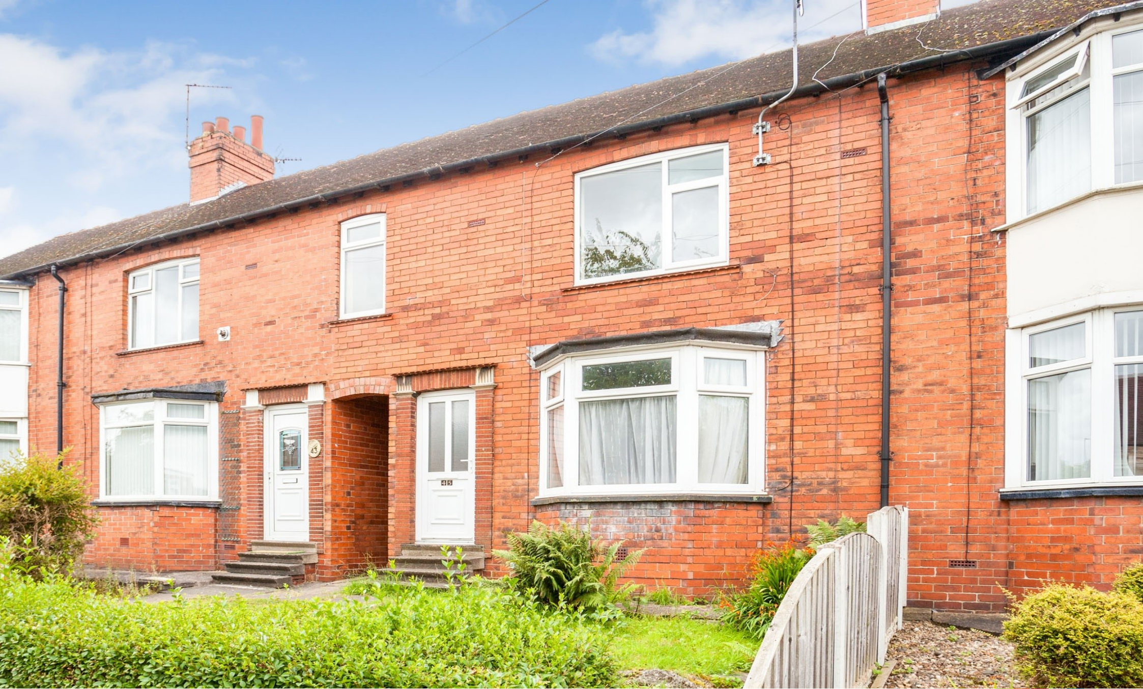
Beechwood Avenue, Wakefield WF2 9JY