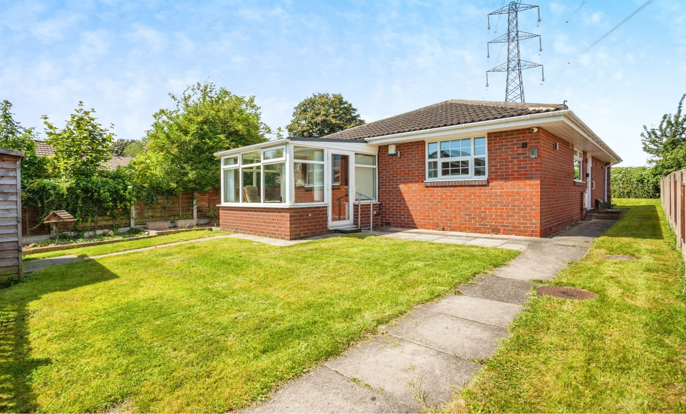
Meadow Garth, Wakefield WF1 3TE