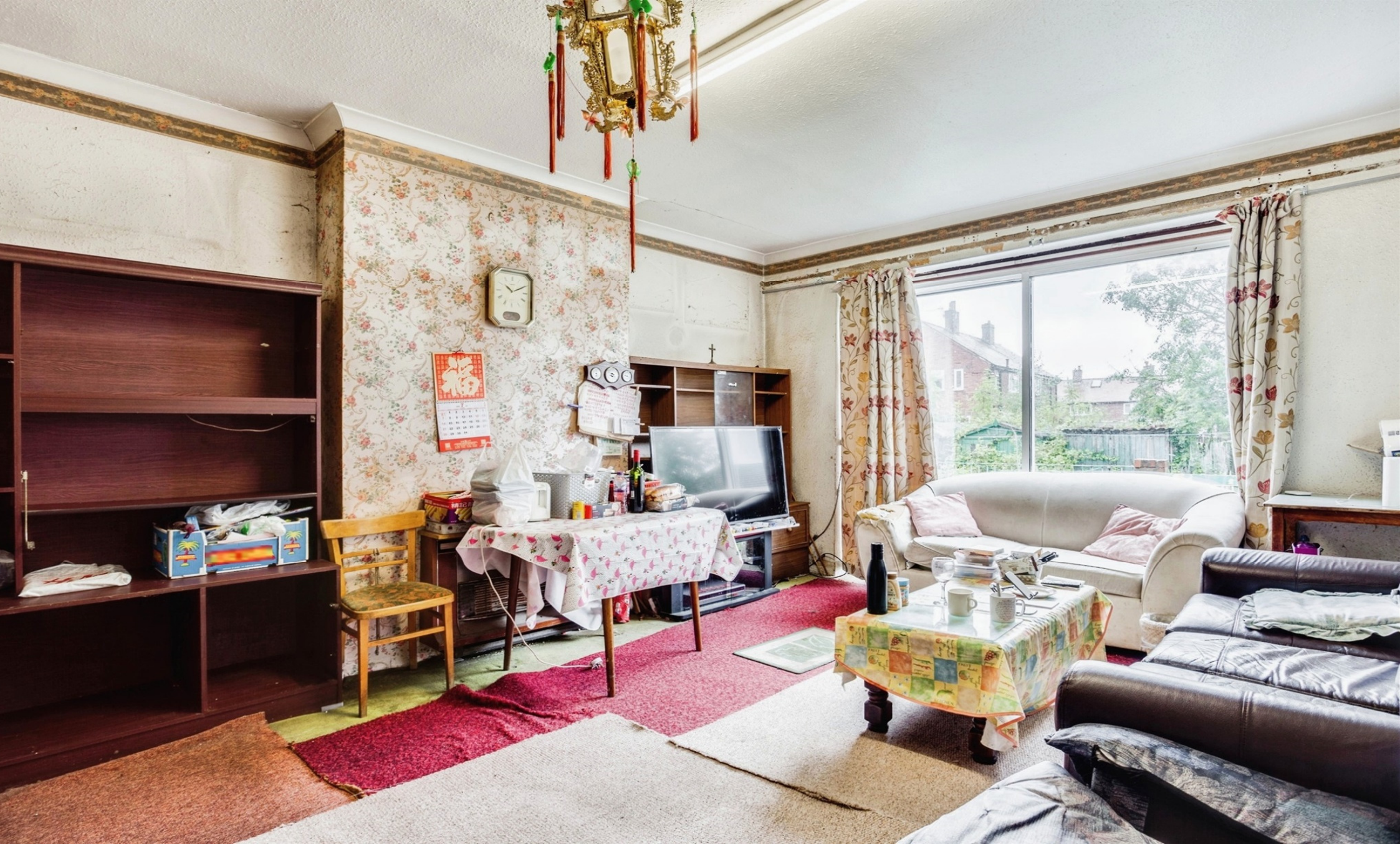
Weeland Road,Sharlston Common Wakefield WF4 1DA