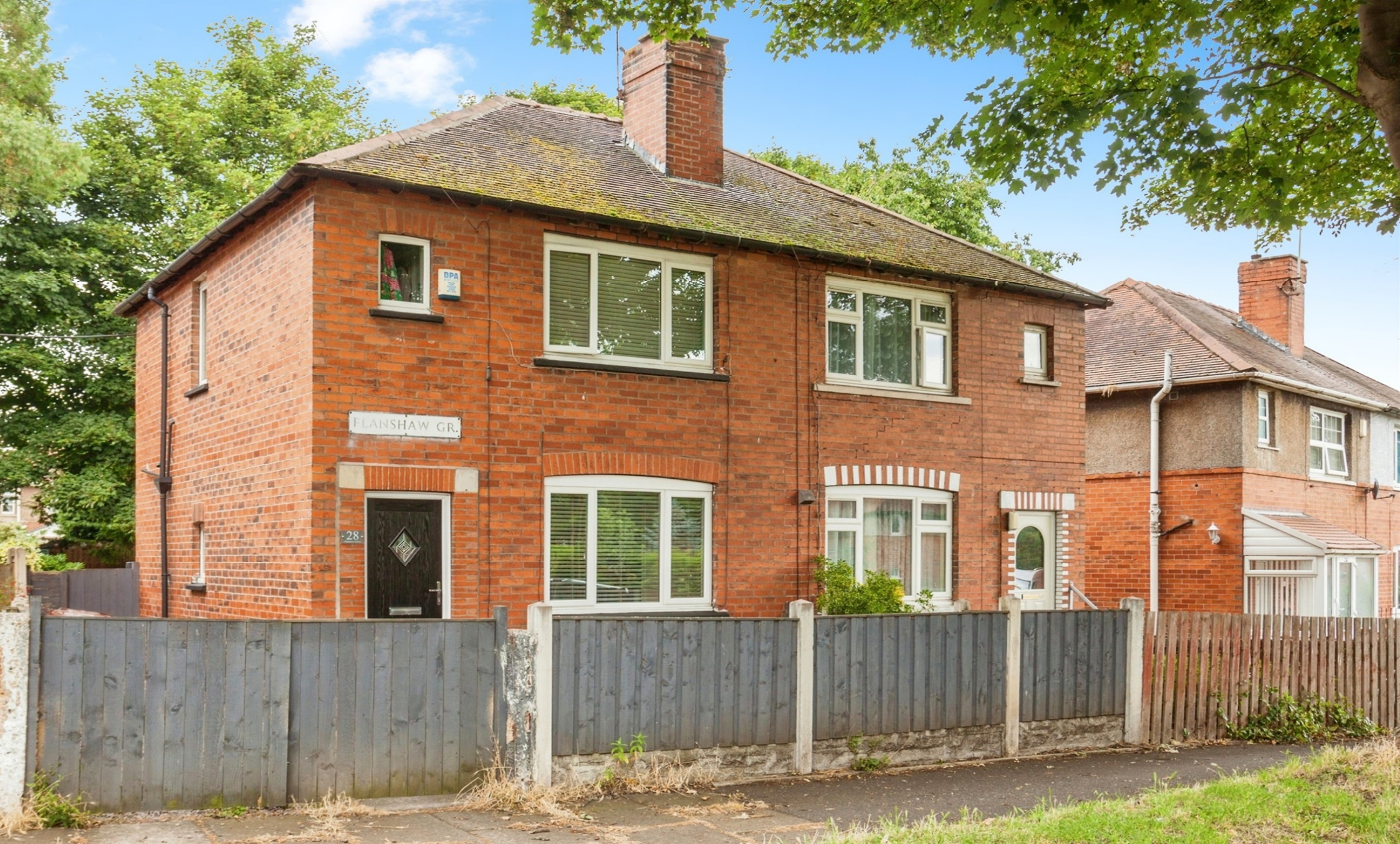
Flanshaw Grove, Wakefield WF2 9LH