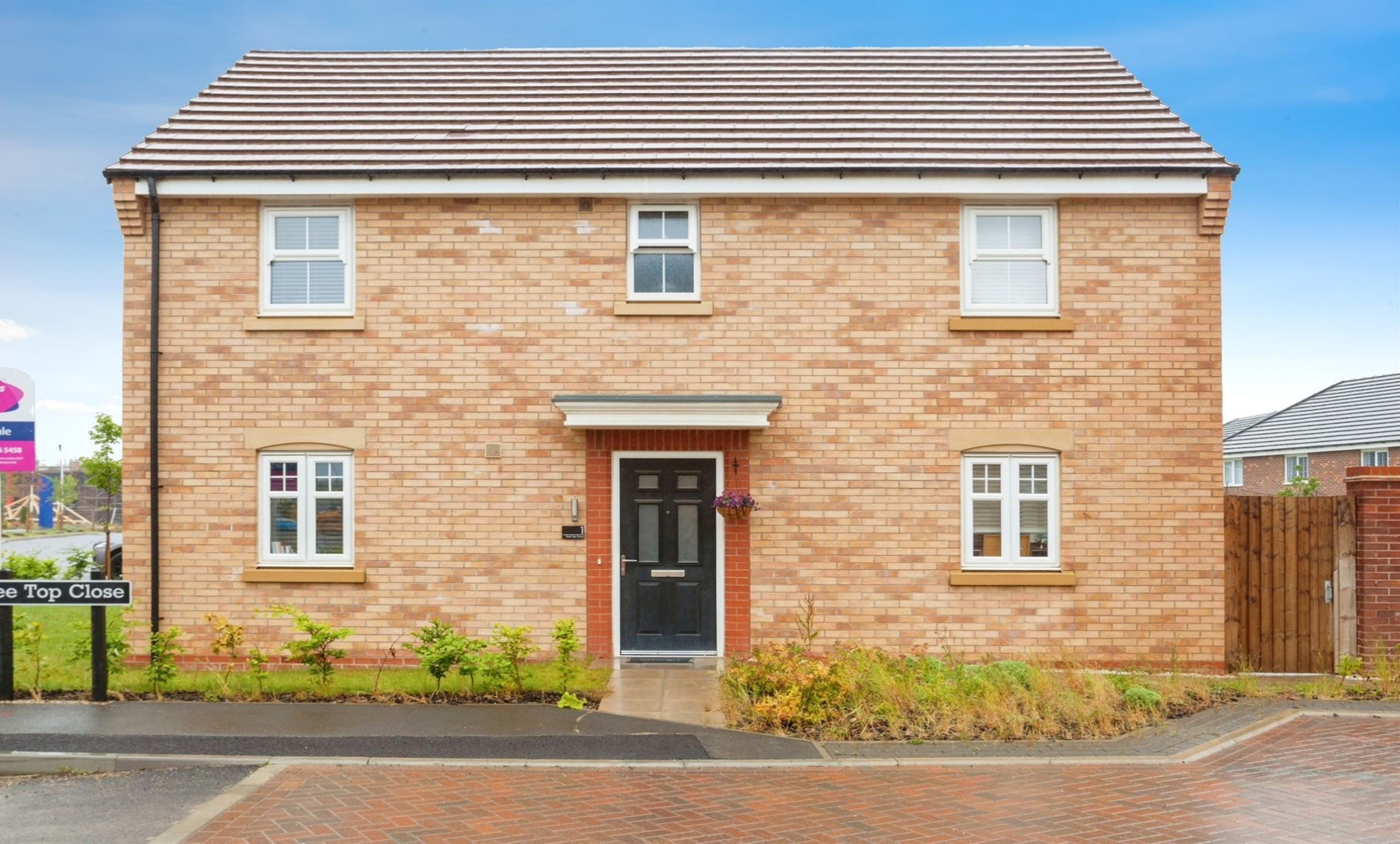
Tree Top Close, Stanley Wakefield WF3 4GL