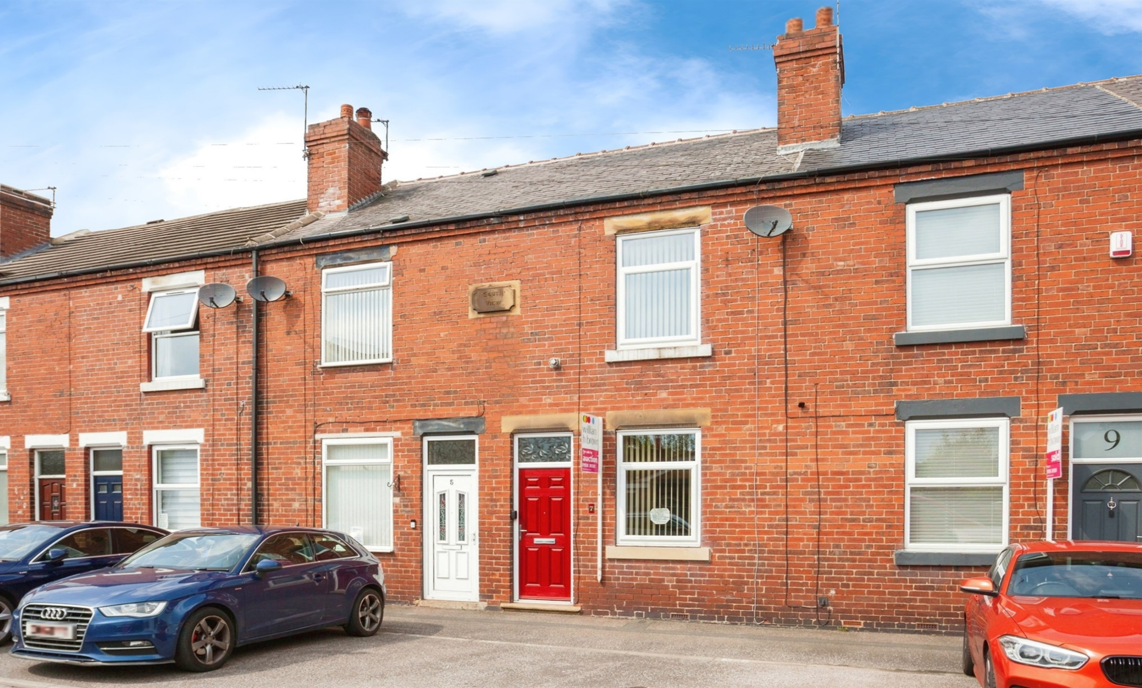
Durkar Low Lane, Durkar WAKEFIELD WF4 3BN