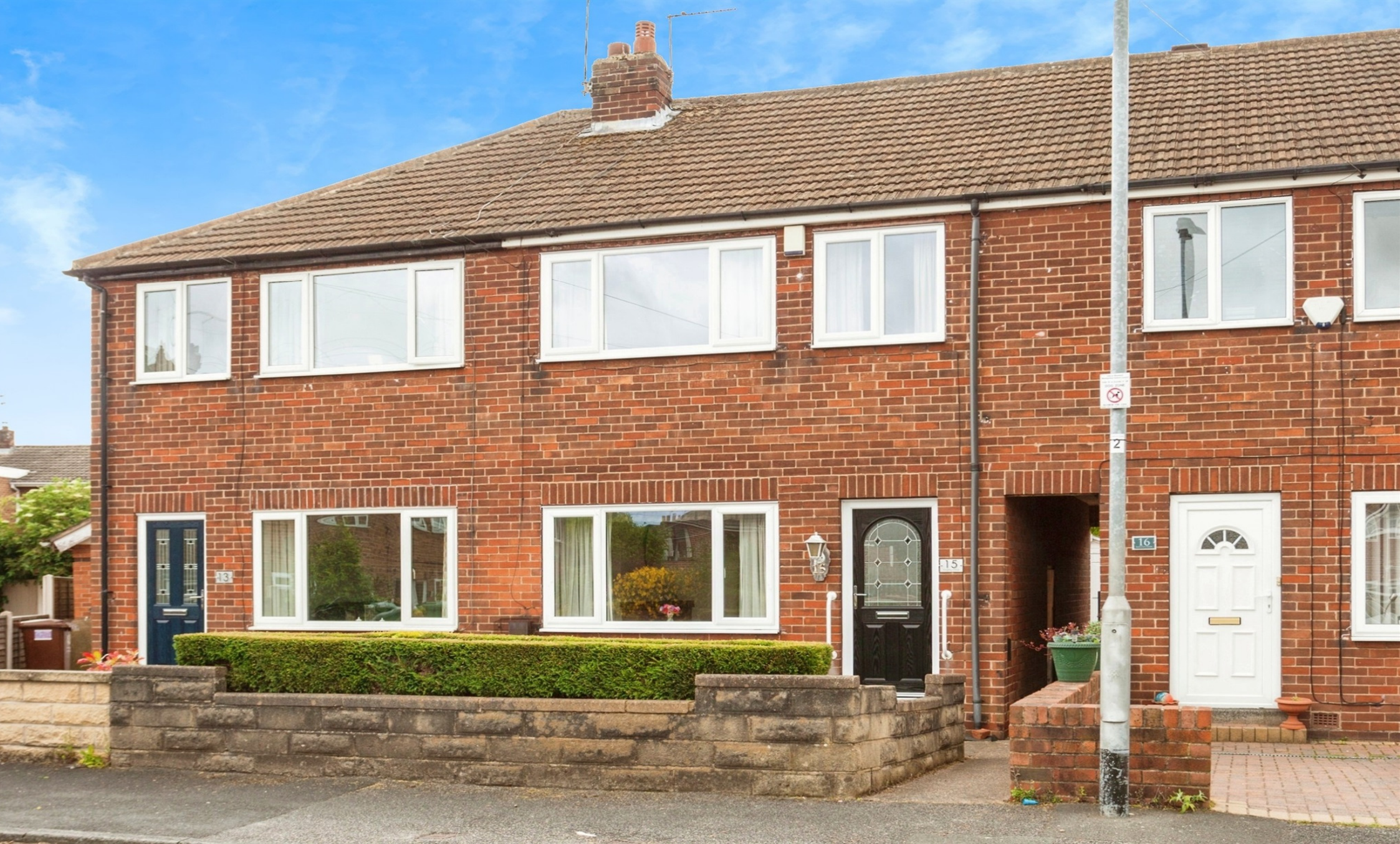
Kingsley Close, Outwood Wakefield WF1 2LB